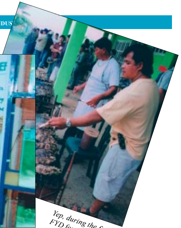
Yep, during the field trip hosted by FYD for the participants to their farm south of Bacolod City, some tilapias were cooked! Tilapia harvest can augment income from shrimp