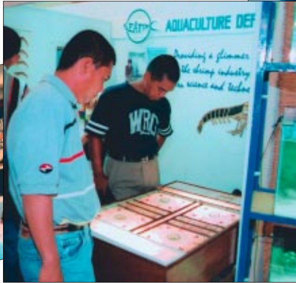
Curious participants take a look at SEAFDEC/AQD's environment-friendly shrimp farm model at the exhibit. See also pages 7 and 8 for a summary of product presentations at the congress