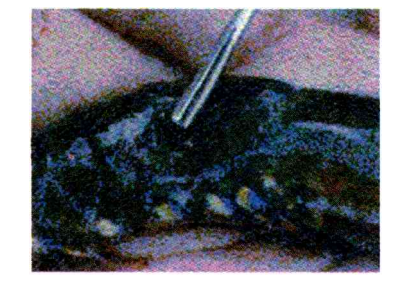
Figure 2.15 Calcium and phosphorus deficiencies. Soft-shelled shrimp mainly due to calcium and phosphorus deficiencies has caused losses in the shrimp industry.

Fish may totally or partially meet their calcium requirement through absorption of calcium from the water via their gills, fins and oral epithelia. The gills are the most important site of calcium regulation. Generally,