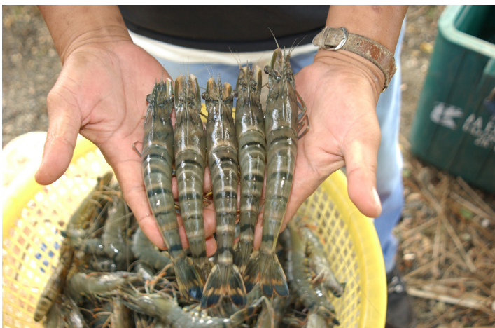
Giant tiger prawn, Penaeus monodon at farm