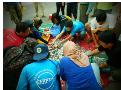
Participants practicing the stock assessment model

Rayong Province, Thailand and (Second Level) from 12 to 26 March 2016 at Training Department. Twenty trainees of each level were from countries around the Gulf of Thailand including Myanmar and took the responsibility of studying the fisheries stocks, i.e. anchovy, Indo-Pacific mackerel, tuna and etc. In first level, basic knowledge of fisheries biology was imparted to trainees as well as capacity building on data collection, biostatistics sampling techniques, and fishery biology related with stock assessment. The second level was designed to provide knowledge on various stock assessment models. The practical sessions made use of countries’ data that collected after finishing the second level. Trainees report their results of assessment to the instructors at the end of each practice model. ☒