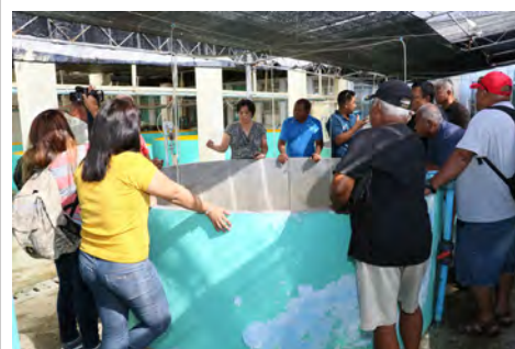
Visitors at the hatchery facilities of AQD Main Station

Thirteen officials and staff from Ngatpang and Ngarchelong States of Palau toured AQD facilities on 17-18 March 2016.