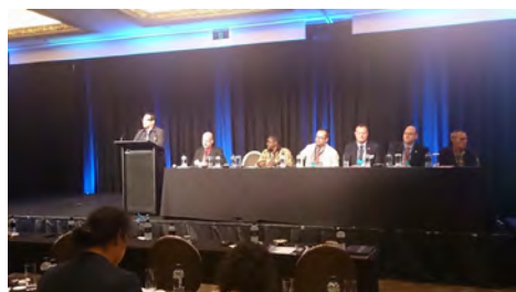
SEAFDEC representative at the GFETW Workshop