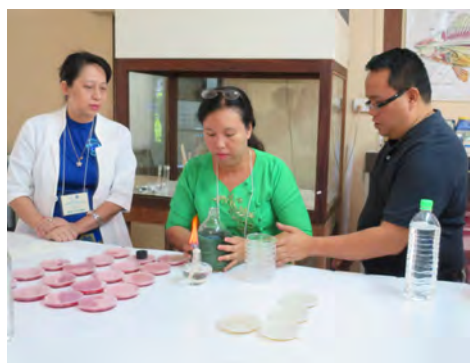
Participants of the training course on fish health management

Eleven fish health officers of the Department of Fisheries-Myanmar participated in the training course on Health Management of Bacterial and Parasitic Diseases of Freshwater Fish Species organized by AQD with funding support from the Government of Japan Trust Fund (GOJ-TF). The training was held in Yangon, Myanmar from 18 to 21 January.