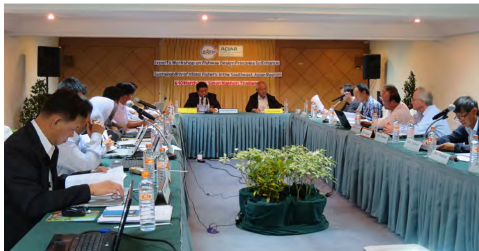
Participants of the Workshop on Fishway Design

SEAFDEC convened the “Experts Workshop on Fishway Design Principles to Enhance Sustainability of Inland Fishery in the Southeast Asian Region” on 6-10 March 2016 in Thailand and Lao PDR, with financial support from the Australian Centre for International Agricultural Research (ACIAR). Attended by regional and international experts, officers and experts of the Department of Fisheries and the Royal Irrigation Department of Thailand as well as the SEAFDEC Secretary-General, and concerned officers of SEAFDEC Secretariat, Training Department (TD), and Inland Fishery Resources Development and Management Department (IFRDMD), the Workshop