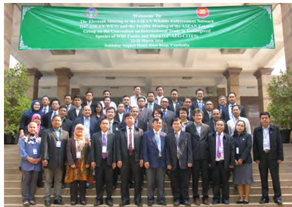
Participants of the ASEAN Experts Group on CITES Meeting