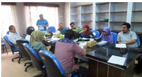
IFRDMD Staff at the in-house training course on co-management on inland fisheries

Inland fisheries is an important component of the economies of many countries in the region. It creates employment and income, and serves as source of food supply. This contribution is particularly important in poverty alleviation, food security and nutritional well-being of many rural communities, particularly in developing countries, as well as the low income food deficit countries. In order to address the important issue pertaining to the sustainability of freshwater fish resources, the SEAFDEC Inland Fishery Resources Development and Management Department organized the "In-House Training of Co-