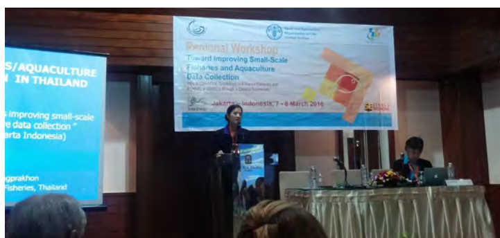
Resource person from Thailand presenting a paper during the workshop

A fishery governance and management system scientist of the Training Department (TD) participated in the Regional Workshop Towards Improving Small-Scale Fisheries and Aquaculture Data Collection from 7 to 8 March 2016 in Jakarta, Indonesia which was organized by FAO in collaboration with