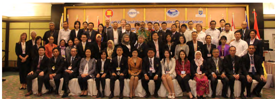
Participants from SEAFDEC and Stakeholders attending the Meeting

SEAFDEC with support from the Japanese Trust Fund and SEAFDEC-Sweden Project organized the Stakeholders' Consultation on Regional Cooperation in Sustainable Fisheries Development towards the ASEAN Economic Community: Combating IUU Fishing and Enhancing the Competitiveness of ASEAN Fish and Fisheries Products in Bangkok, Thailand on 1-2 March 2016.