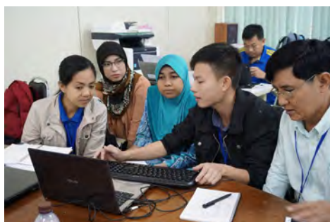
Participants of the training course brainstorming the idea of stock assessment

SEAFDEC Training Department (TD) in collaboration with the SEAFDEC Marine Fishery Resources Development and Management Department (MFRDMD) and SEAFDEC-Sweden Project organized the Regional Training Course on Stock Assessment (First Level) from 29 January to 5 February 2016 at