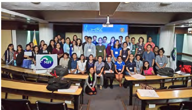
Participants of the Genomics Lecture