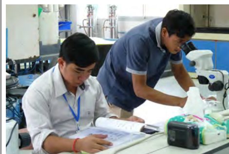
Trainees during the Workshop on Larval Fish Identification

SEAFDEC Training Department in collaboration with SEAFDEC-Sweden Project organized “The 1 st Regional Training Workshop on Larval Fish Identification and Fish Early-Life History Science” from 1 to 13 February 2016 at the TD premises in Samut Prakan. Fifteen young fishery researchers/biologists from fisheries agencies of four participating countries, namely Cambodia, Myanmar, Thailand and Viet Nam participated in this training workshop. Basic knowledge on the process of conducting larval fish surveys and practical experience on larval fish identification up to family level was provided during the course. ☒