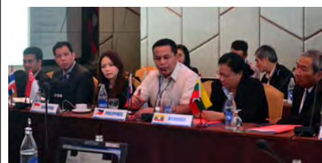
Participants from SEAFDEC Member Countries

Training Department in collaboration with SEAFDEC Secretariat organized the Experts Meeting on Regional Cooperation to Support the Implementation of Port State Measures in Southeast Asian Region from 2 to 4 February 2016 in Bangkok, Thailand. Forty two participants representing the SEAFDEC Member Countries, SEAFDEC Departments, FAO, USAID and relevant agencies participated in the Meeting. The Meeting came up with: 1) identified issues for harmonization to support the implementation of PSM in the region and 2) concept proposal on regional cooperation to support the implementation of Port State Measures to be addressed by the SEAFDEC Council and high-level authorities under the ASEAN mechanism.