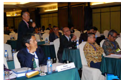
Participants discussing labor issues in the fisheries sector during the Consultation