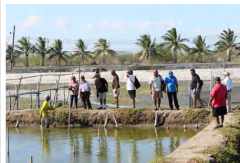
(Above) Visitors at Dumangas Station and (Below) Visitors at Igang Marine Station facilities

On the second day, the Palauan visitors went to see the facilities at Igang Marine Station in Nueva Valencia, Guimaras, Philippines. ☒