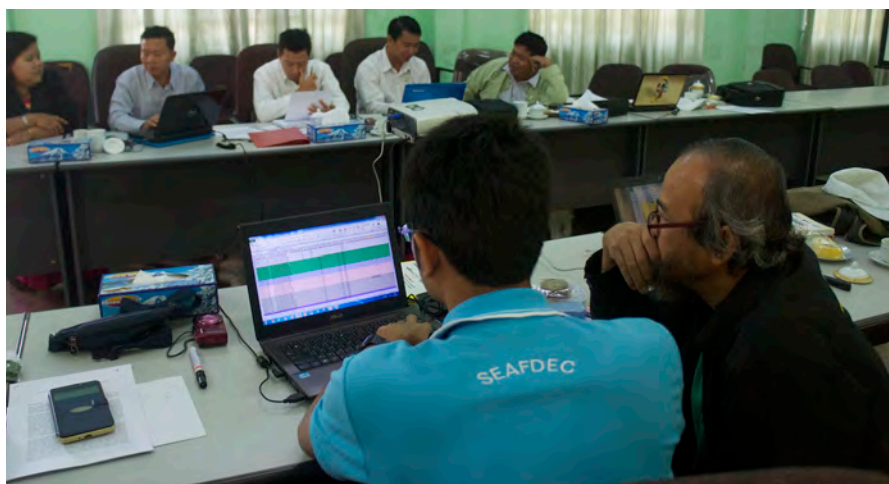
Participants during the Workshop on Validation of Sharks and Rays Landing Data

The National Workshop on Validation of Sharks and Rays Landing Data was organized by TD and MFRDMD in Yangon, Myanmar from 9 to 11 February 2016. Attended by local enumerators in selected sharks/rays landing sites in Myanmar, namely: Mawlamyine and Yangon, the workshop was part of the SEAFDEC Sharks Project which carries out a 1-year Data Collection since July 2015. The specific objective of the