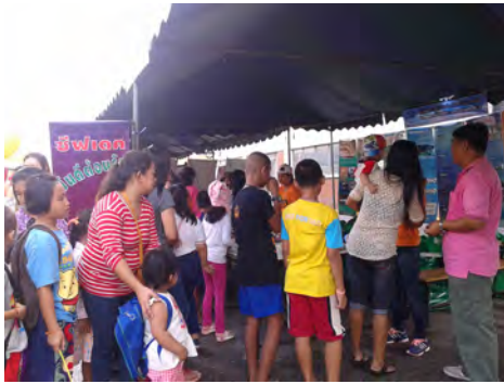
Children entering TD Booth at the Children's Day exhibition

Training Department in collaboration with the Fish Marketing Organization (FMO) and Navy organized the 2016 Nation Children's Day at Pathumthani Provincial Cooperative Office and at the Prachunlajomklao Navy Dockyard,