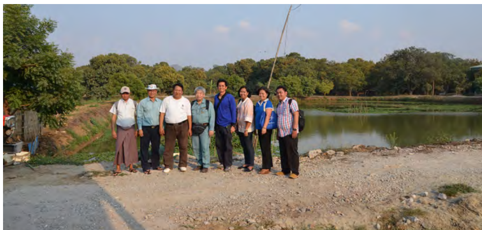
Participants from AQD and SEAFDEC Departments visit eel fisheries and farming facilities

AQD participated in the surveys of eel fisheries and farming practices in Indonesia and Myanmar which were organized by the SEAFDEC Inland Fisheries Resources Development and Management Department (IFRDMD) last 18-21 January and 6-10 February, respectively.