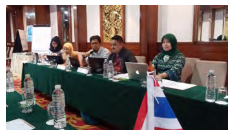
Participants during the Data Collection Workshop