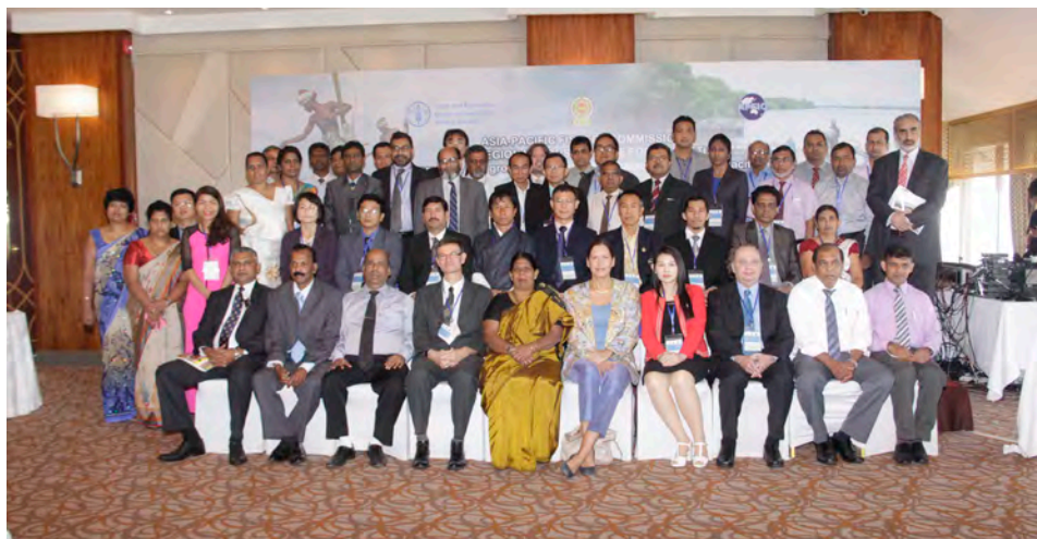
Participants of the APFIC Regional Consultative Forum Meeting

Two representatives from SEAFDEC Training Department (TD) participated in the Sixth APFIC Regional Consultative Forum Meeting on “Promoting blue growth in fisheries and aquaculture in the Asia-Pacific” from 8 to 10 February 2016 in Colombo, Sri Lanka which was organized by APFIC, FAO and Ministry of Fisheries and Aquatic Resources Development, Sri Lanka. During the Meeting, TD made three presentations: