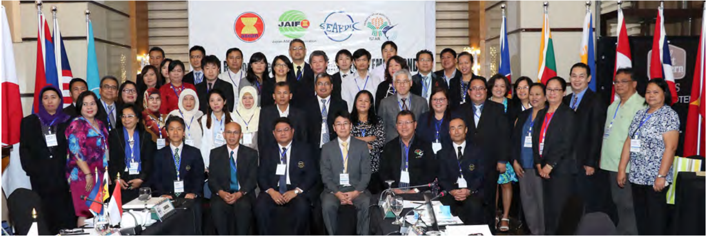
Participants in the ASEAN Regional Technical Consultation on EMS/AHPND and other Transboundary Diseases for Improved Aquatic Animal Health Management in Southeast Asia

Early Mortality Syndrome (EMS) also known as Acute Hepatopancreatic Necrosis Disease (AHPND) and other Transboundary Diseases” were the topics of the ASEAN Regional Technical Consultation organized by AQD and the Philippine Department of Agriculture-Bureau of Fisheries and Aquatic Resources (DA-BFAR) organized from 22 to 24 February in Makati City, Philippines.