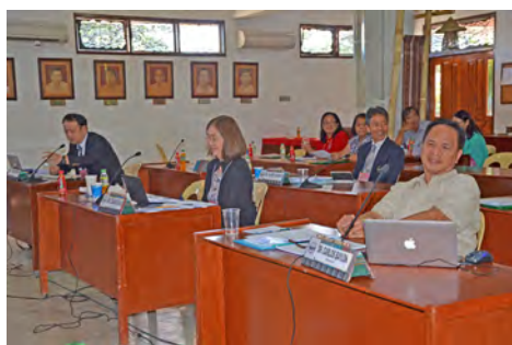
The external evaluators and participants during the Annual Progress Meeting

The 2015 Annual Progress Meeting of the AQD Programs under the ASEAN-SEAFDEC Consultative Group Mechanism Funded by the Government of Japan-Trust (GOJ-TF) was held on 29 January at AQD’s Tigbauan Main Station. The meeting reviewed the projects implemented in 2015 and discussed the proposed research activities for the period 2015-2019. The external evaluators were Dr. Koh-ichiro Mori