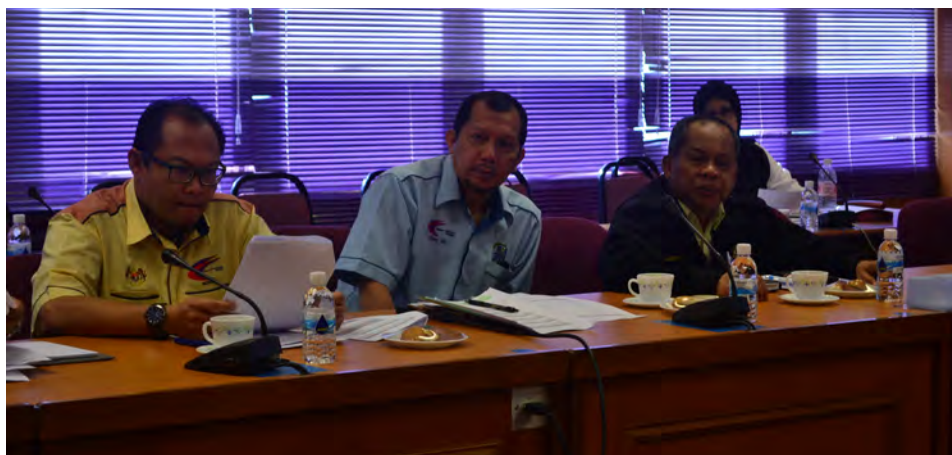
Participants of the working team giving suggestions during the meeting

The Working Team Meeting on the Result Discussion of Baseline Survey on Monitoring and Control of Fishing Effort and Landing in the Western Gulf of Thailand is an activity of the project “Strengthen Malaysia and Thai Partnership in Support of Joint Fisheries Planning and Management in the Western Gulf of Thailand” which was convened from 1 to 2 March 2016 at SEAFDEC Marine Fishery Resources Development and Management Department (MFRDMD)