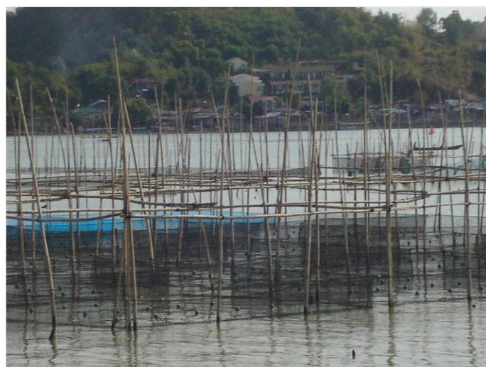
Cage culture of tilapia in Laguna de Bay, Philippines

The country’s tilapia industry comprises various ‘players’ whose roles are crucial in the attainment of the goal as specified in the country’s Master Plan for the Tilapia Industry (i.e., to increase farmed tilapia production from 122,000 mt in 2002 to 250,000 mt in 2010). Recognizing