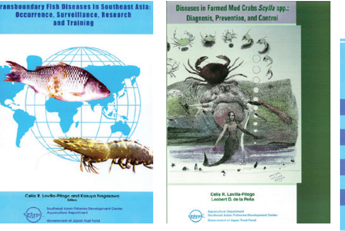
Publications relevant to fish diseases produced by AQD under the projects supported by the Japanese Trust Fund

With the cooperation of the Singapore-based SEAFDEC Marine Fisheries Research Department (MFRD), studies have been conducted to develop detection methods of residual antibiotics in aquaculture products. Oxolinic acid (OXA) and tetracycline (TC) are the most extensively used antibiotics in aquaculture and in order to determine the residue levels of OXA and TC in aquaculture products, high performance liquid chromatography methods had been developed (Tan et al., 2005). Moreover, a compilation of the methods for chloramphenicol and nitrofuran residue testing were prepared by MFRD and AQD and disseminated to the region's fish disease laboratories (Ruangpan and Tendencia, 2004; Borlongan and Ng, 2004). Furthermore, evaluation methods for residual chemicals in aquaculture products have been established to secure the safety of aquaculture products while the use of antibiotics in the region's aquaculture industry has been closely monitored (Borlongan, 2005; Ruangpan and Pradit, 2005).