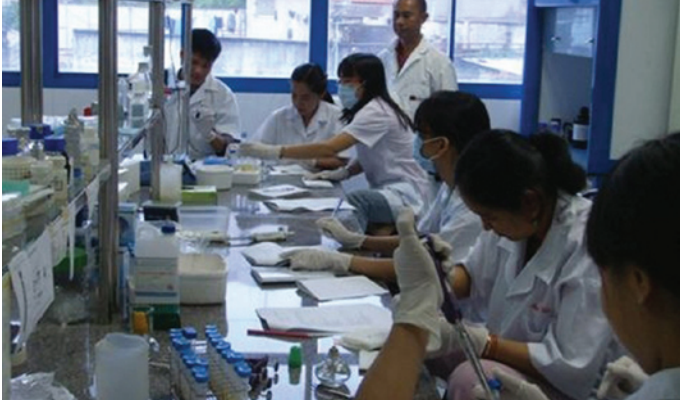
On-site training on carp KHVD and Spring Viraemia of Carp (SVC) detection conducted by AQD in Vietnam

Diseased grouper (above) and shrimp (left)