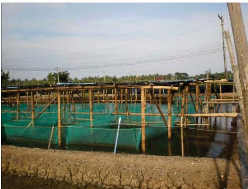
Figure 2. Net cages installed in ponds used for nursery rearing of Scylla serrata .

Nursery rearing is done in net cages installed in ponds (Figure 2) for easy retrieval of stocks. For Phase 1, this previously involved megalopae for stocking (Rodriguez et al. , 2007a). However, C 1 is now used for stocking (Quinitio et al. , 2009; SEAFDEC/AQD et al. , 2010) in the nursery and this may be due to ease in transport at this stage. Phase 1 and 2 may be done one after the other separately or continuously using the same pond compartment. The culture period is 3-4 weeks in each phase depending on the desired size at harvest.