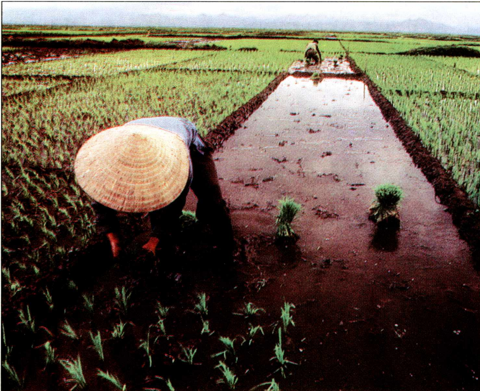
A rice farm in Vietnam.