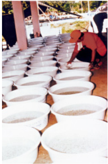
A harvest of milkfish fry from the hatchery