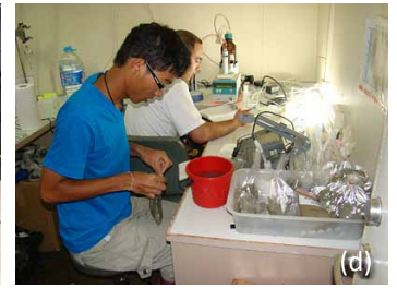
(a-c) Collection of physico-chemical data, and (d) data on biological oceanography