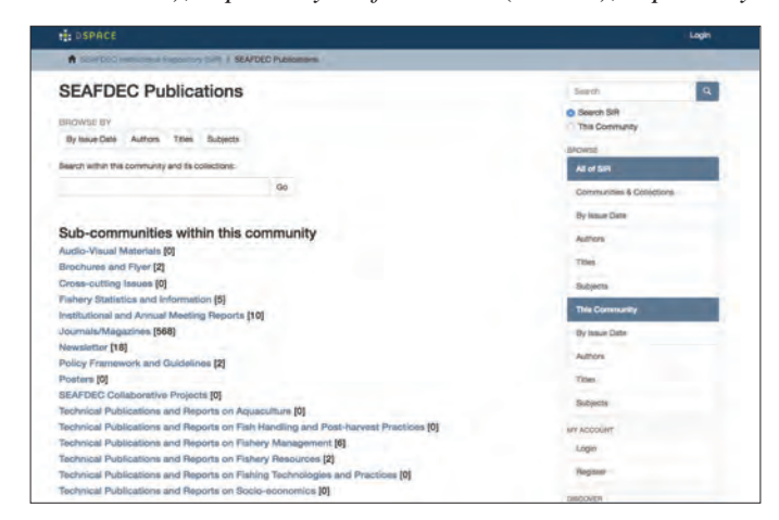
Example of community and sub-communities in the SEAFDEC Institutional Repository

Based on the results of the 2017 Workshop, the Secretariat and Departments have already initiated the establishment of separate repositories, which would carry the domain names: repository.seafdec.org (for the SEAFDEC Secretariat and MFRD), repository.seafdec.or.th (for TD), repository.