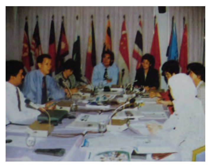
Launching of SEAFDEC Information Staff Exchange Program in 1995

The libraries of SEAFDEC Secretariat, TD, MFRD, AQD, MFRDMD, and recently the IFRDMD have continued to provide information services for their respective staff members as well as external visitors. For the Secretariat, the library contains publications produced by the Secretariat and Departments, and aimed primarily to serve as reference materials for staff and visitors. With collections of reference materials produced by SEAFDEC and other sources, particularly on subject matters that fall under their mandates, the Department libraries offer general library services, book loan services (including interlibrary loans), and on-line information services through their departmental websites as well as online bibliographic search. These services are