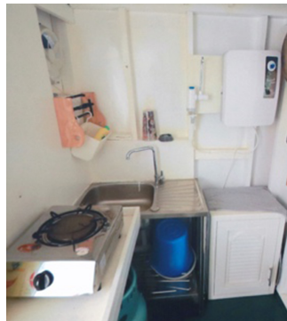
Renovation of the sleeping quarter, mess room, toilet, and galley in compliance with C188