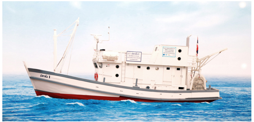
The M.V. PLALUNG 1 prior to (left) and after the renovation (right)

superstructure to facilitate retrieving of trawl net with minimal number of fishing crew. A sewage tank was also installed in the engine room to treat all wastes onboard prior to disposal.