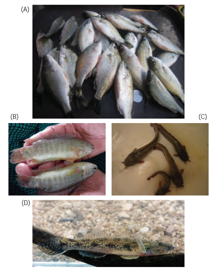
Figure 2. Selected Philippine native freshwater fish species found in Laguna de Bay, Luzon Island, Philippines. (A) silver therapon, (B) climbing perch, (C) Asian sea catfish, and (D) freshwater Celebes goby

Laguna de Bay is home to a number of native freshwater fish species that have great potentials for aquaculture. Figure 2 shows some of the species, such as the silver therapon ( Leiopotherapon plumbeus ), climbing perch ( Anabas testudineus ), Manila sea catfish ( Arius manilensis ), freshwater