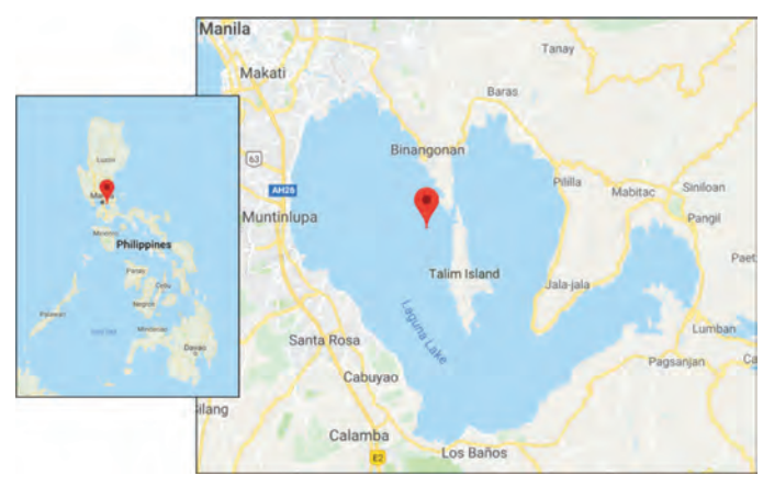
Figure 1. Location of Laguna de Bay in Luzon Island, Philippines

The Philippines has about 361 freshwater fish species found in inland water bodies, with 181 considered as native aquatic species (Froese & Pauly, 2019). Also, the country has more than 80 lakes (Palma, 2016) and the largest of which is the Laguna de Bay ( Figure 1 ) located in Luzon Island. With a total area of 90,000 ha, Laguna de Bay is also the third largest freshwater lake in Southeast Asia having an average depth of about 2.8 m, and elevation of about 1.0 m above sea level.