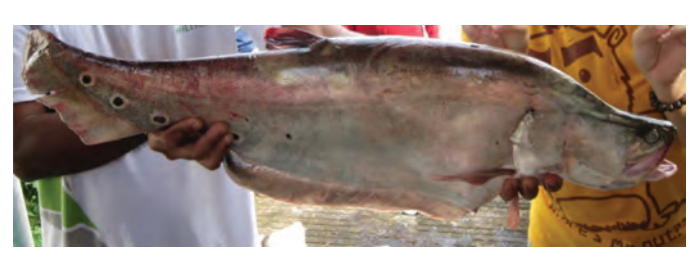
Figure 5. Knife fish, Chitala ornata , is a predatory fish that have caused the significant decline of native aquatic species in Laguna de Bay, Luzon Island, Philippines

Recently, a report on the feeding ecology of knife fish in Laguna de Bay found silver therapon as the most important component of its diet (Corpuz, 2018), resulting in the significant decline of wild silver therapon population in the lake. Consequently, it was also reported that the livelihood of