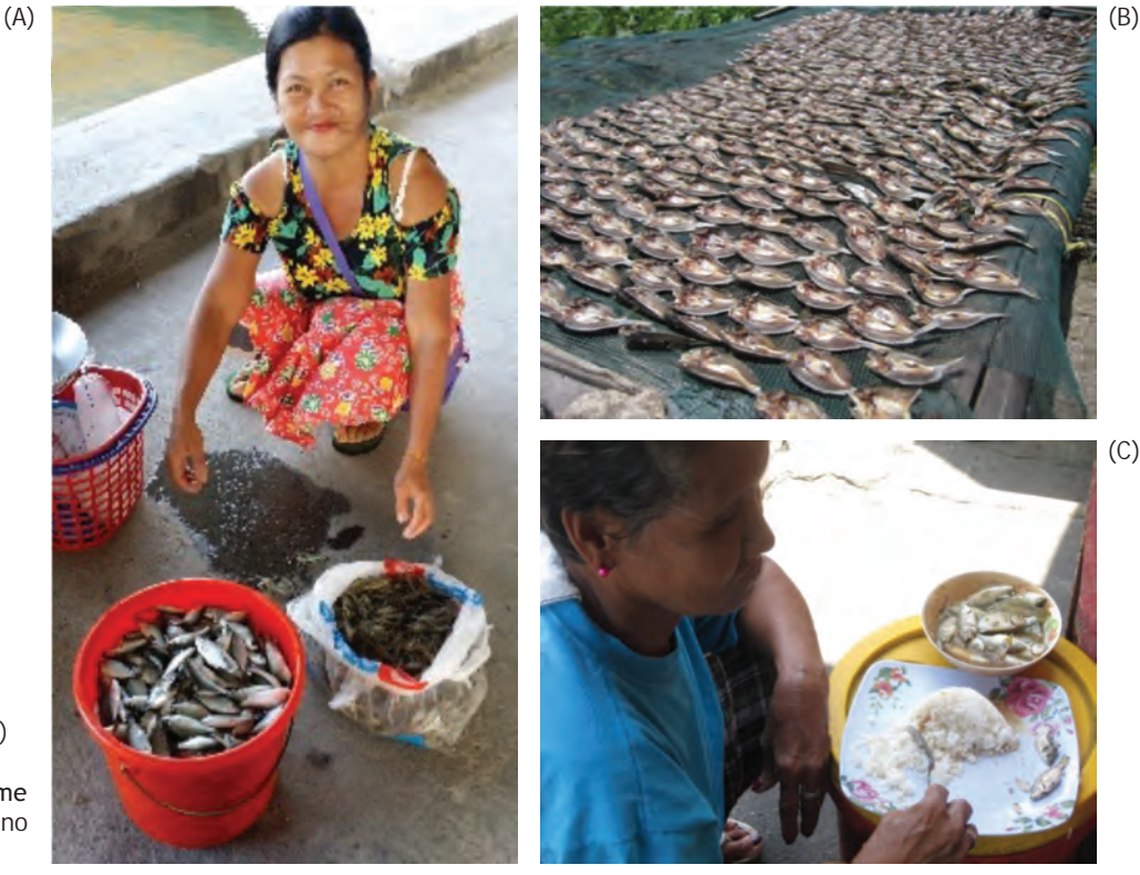
Figure 4. Fresh (A) and dried (B) silver therapon sold in lakeside fishing communities, locals consume ayungin sinigang, a delicious Filipino sour soup dish (C)