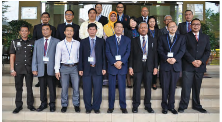
Participants of the 2 nd Regional Technical Consultation on Promotion of the ASEAN Guidelines for Preventing the Entry of Fish and Fishery Products from IUU Fishing Activities into the Supply Chain

Subsequently, the progress of implementation of the ASEAN Guidelines was followed up through self-evaluation during the consultative country visits conducted by MFRDMD in 2018 and at the Terminal Meeting of the Project in 2019.