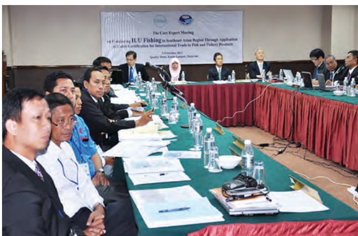
Participants of the Core Expert Meeting on Combating IUU Fishing in Southeast Asian Region Through Application of Catch Certification for International Trade in Fish and Fishery Product, 7-9 October 2013, Kuala Lumpur, Malaysia