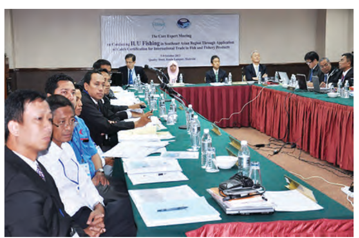
Participants of the Core Expert Meeting on Combating IUU Fishing in Southeast Asian Region Through Application of Catch Certification for International Trade in Fish and Fishery Product, 7-9 October 2013, Kualar Lumpur, Malaysia

Subsequently, after incorporating the suggestions made during the 17th Meeting of Fisheries Consultative Group of the ASEAN-SEAFDEC Strategic Partnership (FCG/ASSP) in December 2014 and the 47th Meeting of the SEAFDEC