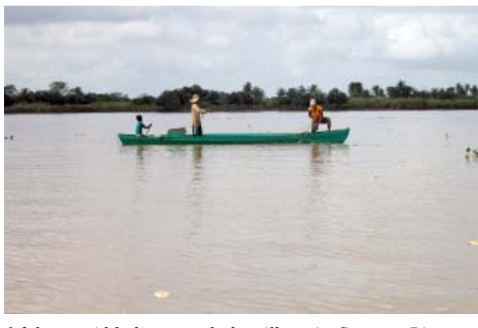
1.3 kg gravid ludong caught by gill net in Cagayan River, northern Philippines (top); and actual gill net fishing operation in Cagayan River for catching ludong (above)