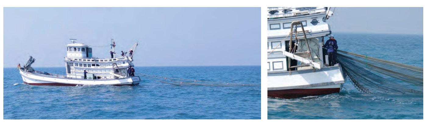
Figure 7. Operation of the hydraulic net drum of M.V. Plalung

engine was implemented to power these spools. The net drum, which consists of hydraulic components, was placed at the stern portion, while the towline was placed at the middle of both sides. This helped to improve the efficiency and safety of the vessel during trawling.