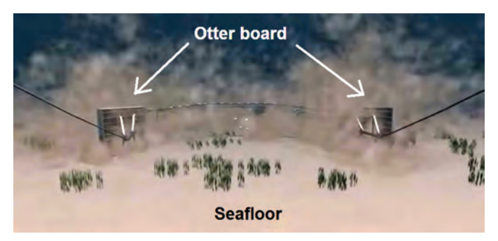
Figure 2. Otter boards of bottom trawl damage the seafloor

Basically, the design of M.V. Plalung resembles typical Thai trawlers. However, bottom trawling is an indiscriminate fishing method and is considered one of the most destructive ways to catch fish causing significant harm to the seafloor. The bottom trawl ( Figure 2 ) is an unselective fishing gear that often catches juvenile fish and results in overfishing due to a large number of dead fish discarded. With the goal of promoting responsible fishing practices to decrease the negative impacts of trawl fishing on the marine ecosystem, reduce carbon emissions, and mitigate climate change, TD applied the V-shaped otter board to the bottom trawl of M.V. Plalung. Sea trials were performed to examine the energy-saving efficiency and performance of the fishing gear design since 2018 in Tarutao Island, Satun Province, Thailand in the Andaman Sea.