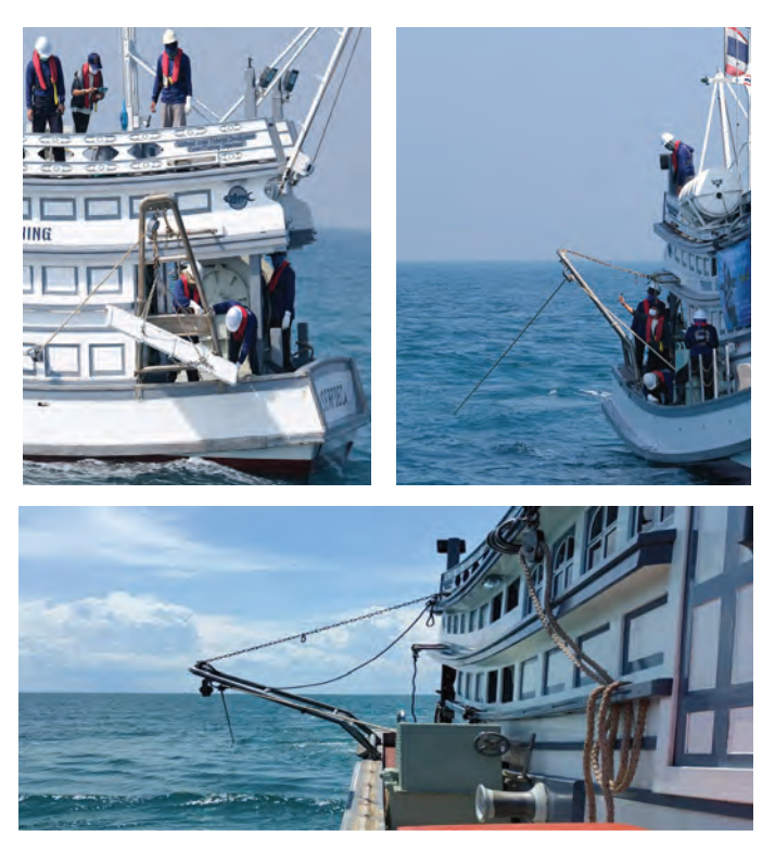
Figure 6. Adjustable U-shaped gallows of M.V. Plalung designed by SEAFDEC/TD

beam trawl and can adjust to the waterline angle, allowing for an extension on each side of the towline ( Figure 6 ). The position of the gallows was crucial, as they must be located forward of the rudder axis to ensure the vessel has sufficient maneuverability.