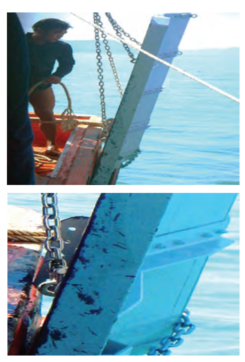
Figure 5. Fewer scratches on the painted footer plate of the V-shaped otter board of M.V. Plalung

The use of a V-shaped otter board resulted in a 5 % reduction in fuel consumption compared to the conventional otter boards, with engine speed reduced from 1,100 rpm to 1,050 rpm while maintaining the same trawl speed. This indicates that operating with V-shaped otter boards can save fuel by 5.4 % while maintaining the same trawl speed. Additionally, the V-shaped otter boards allow for longer trawling distances due to the vessel being able to trawl faster than before, all while using the same engine rotation speed as the conventional otter boards. Regarding vessel control, the V-shaped otter board made the maneuvering of the vessel easier, including turning, compared to the use of flat otter boards. Furthermore, there were a few marks on the painted footer plate (Figure 5) of the V-shaped otter board which indicated that the lifting force of the V-shaped otter board decreased the touch or drag of the bottom trawl resulting in reduced seabed destruction.