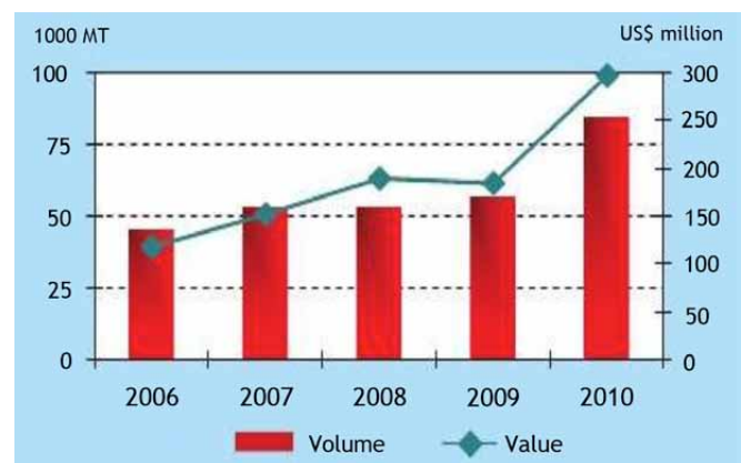
Fig. 1. Tuna export of Vietnam in volume, value and markets from 2006 to 2010