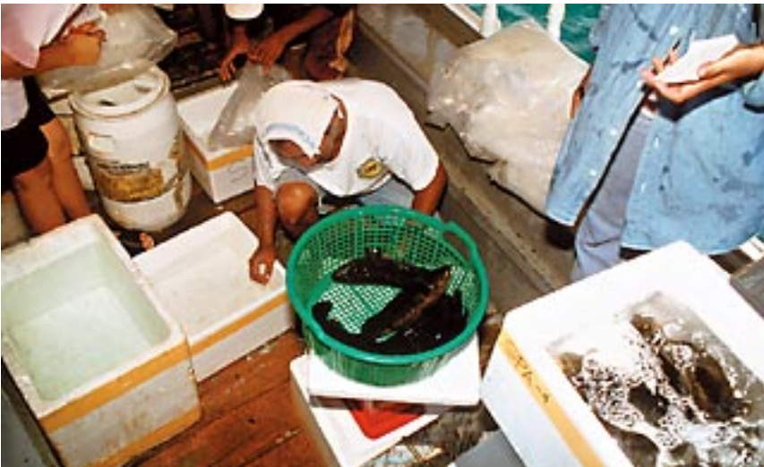
Manual handling of live grouper immediately from a netcage, (top); live grouper being readied for transport in styrofoam boxes, (bottom).