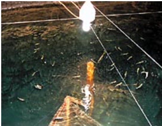
Hides (left); incandescent lamp placed above the cages attract live food such as mysids, copepods, and other young fish (right).