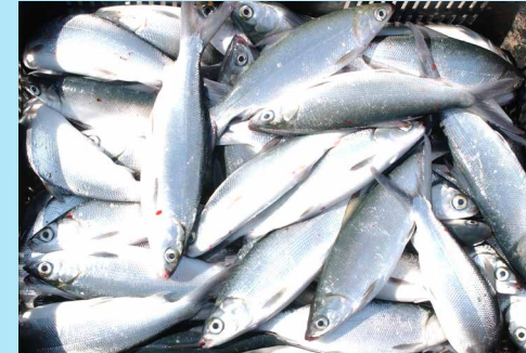
Milkfish ( Chanos chanos )

Several studies were done on the improvement and verification of grow-out culture techniques of milkfish ( Chanos chanos ) in ponds. Recent study on milkfish focuses on verification of feeds using alternative ingredients in pond culture systems.