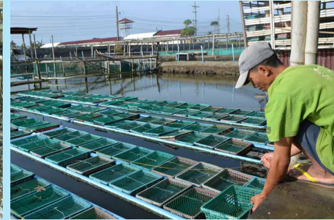
Soft-shell crab production set-up