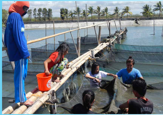
Training activities for students and private individuals

The station accommodates students, technicians, and all interested parties for study-visits and hands-on training on brackishwater aquaculture. DBS staff also provides technical services to fish farmers by offering consultation on culture of fish and crustaceans in ponds. The station also accepts samples for water and soil quality analyses.