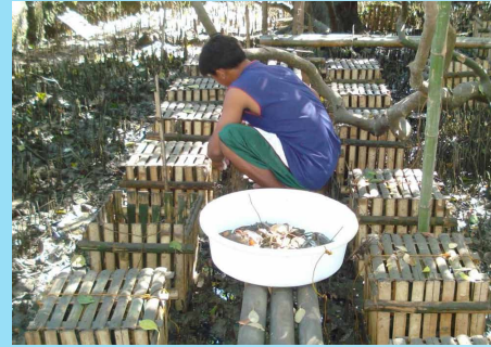
Crab fattening in bamboo pens

conducted. Current research focuses on determining the feasibility of mangrove crab and blue swimming crab ( Portunus pelagicus ) nursery in net cages inside ponds. Likewise, soft-shell crab production using hatchery-produced seedstocks is being demonstrated.