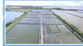
Dumangas Brackishwater Station