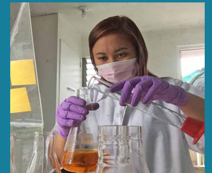
DBS has laboratory facilities to support biosecurity measures

To prevent the occurrence and spread of diseases, proper biosecurity measures are implemented. There are quarantine and laboratory facilities to support the biosecurity measures at DBS. The station's stocks are also monitored routinely by AQD's disease-diagnostic laboratory in SEAFDEC's Tigbauan Main Station.