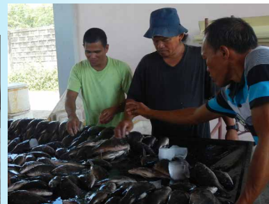
Production harvest at DBS (seabass; top and snapper; below)