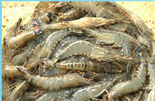
Tiger shrimp ( Penaeus monodon )

The technology for the farming of tiger shrimp ( Penaeus monodon ) using environment-friendly schemes was developed and verified in DBS. Studies on nutrient dynamics of shrimp culture systems and bioremediation strategies were also conducted. White shrimp, Penaeus indicus , are also being grown to marketable size for verification study.