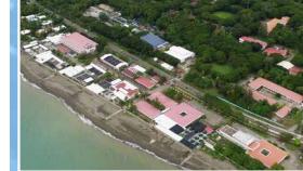
Tigbauan Main Station