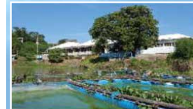
Binangonan Freshwater Station