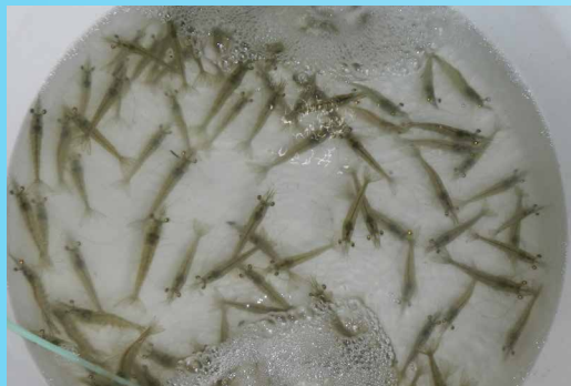
White shrimp ( Penaeus indicus )

Research activities on mangrove crab ( Scylla serrata ) include polyculture with milkfish and monoculture in ponds. Likewise, demonstration and verification of mangrove-friendly aquaculture in pens for crab fattening were