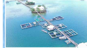
Igang Marine Station