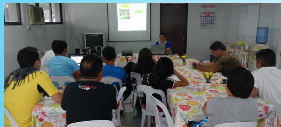
Lectures on production of economically important aquaculture species in ponds