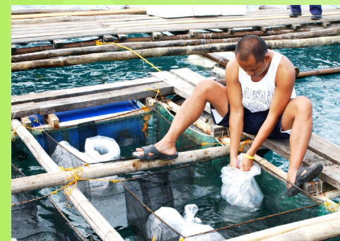
Acclimatizing grouper juveniles in floating net cages

10% of average body weight (ABW) or artificial diet at 3% ABW, with half of the ration given early in the morning and the other half late in the afternoon