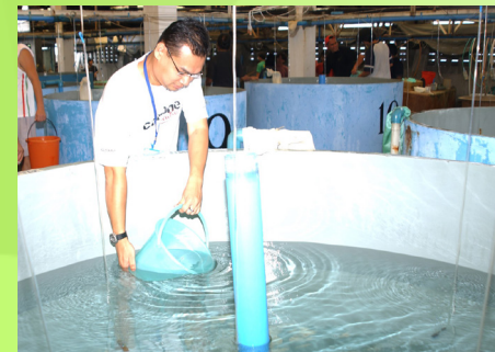
SEAFDEC/AQD's multi-species marine fish hatchery