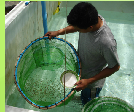
Collecting of grouper fry in rearing tanks