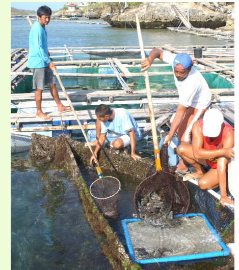
Grouper harvest in floating net cages