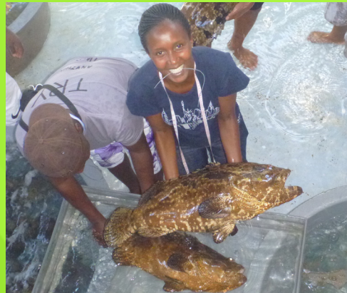
Trainee on Marine Fish Course holding grouper broodstock

G rouper culture has three phases (1) the hatchery rearing where larvae are reared from hatching until 60 days, (2) the nursery rearing where fish is cultured for 1-2 months, and (3) the grow-out stage where fish is reared for 6-8 months. Grouper should be sorted and size-graded during the late hatchery and nursery stage to prevent cannibalism. Other routine procedures include feeding, net maintenance, stock sampling, and monitoring water quality. Groupers can reach the market-size of 300-350 grams in 5-7 months when 2.5-3 inches fry are stocked.