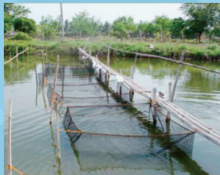
Net cages in a nursery pond