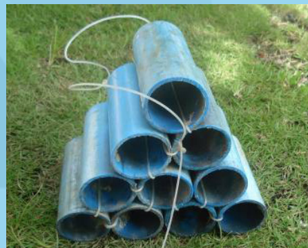
PVC cuttings as fish shelter