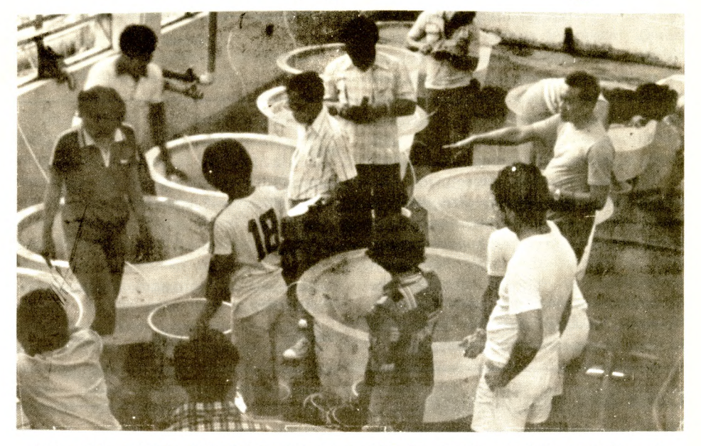
Last year's research methodology trainees practice fry sampling techniques at the wet laboratory of the SEAFDEC Aquaculture Department.