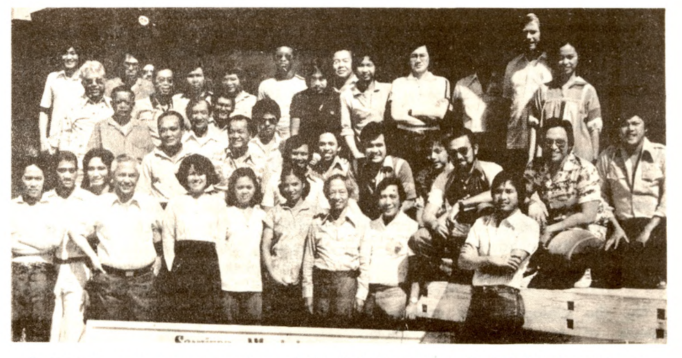
Participants and resource speakers of the first Aquaculture Project Development and Management seminar-workshop. Of fifty-four who made reservations for the course, 35 were able to attend. A second APDEM course is being planned to be held this July.

The project study component involved three major areas: market, technical and financial. Management aspect was co-