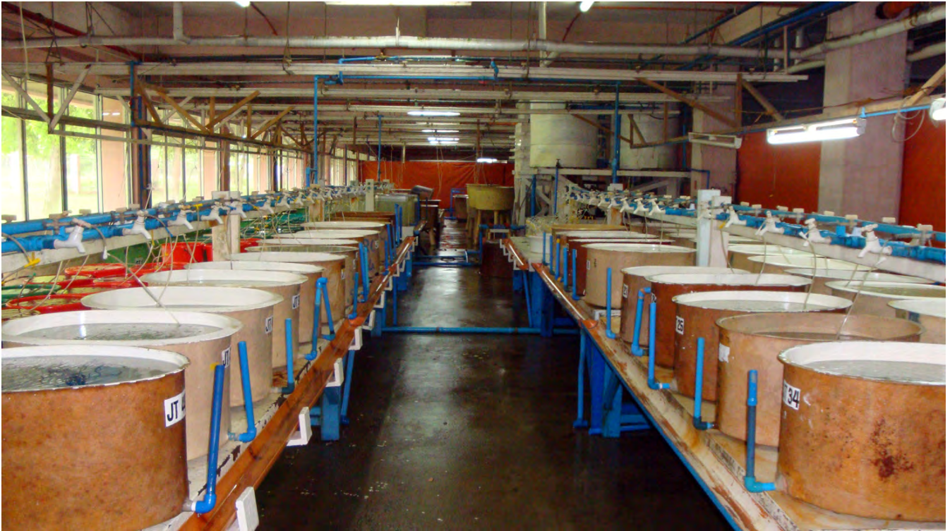
Seahorse hatchery at SEAFDEC/AQD

The challenges facing the aquaculture industry are aplenty, and it is up to SEAFDEC Aquaculture Department (AQD) to help make innovations to sustain the industry. AQD must also help ensure that the aquatic environment maintains its integrity while fish for human food or fish for resource enhancement are produced through aquaculture. The innovations in aquaculture take the form of a simple technique (e.g. feeding disinfected live food) to a complicated biotechnology tool (e.g. development of vaccine). Here are two examples of useful innovations that AQD recently contributed.