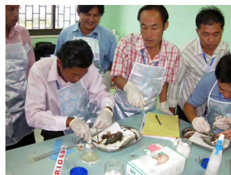
Practical activities on freshwater fish health management