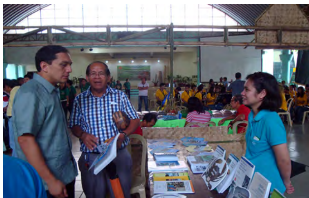
Visitors take interest in AQD publications during the exhibits/fairs