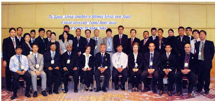
Participants at the RTC on Addressing Technical Issues on Commercially-exploited Aquatic Species

After reviewing the status and trends of the selected commercially-exploited aquatic species that are of international concern, the Meeting discussed and identified some of the management problems for most of the species, particularly on insufficient data and information to support management