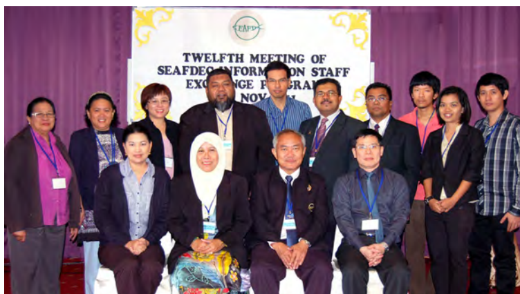
Participants of the 12 th ISEP Meeting held in Kuala Lumpur, Malaysia