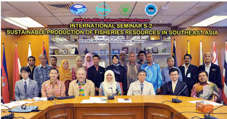
Participants of the International Seminar at MFRDMD

discussed future collaboration, where three professors from Hokkaido University explained about international exchanges under the JSPS Asia-Africa Science Platform Program, fish stock management of walleye pollock in Japan, and research activities of fisheries informatics including green technology, artificial reefs and a new sonar for coastal seaweed research. Two officers from MFRDMD presented their findings on the genetic identification of pelagic fishes in the South China Sea and Andaman Sea, and the overall research activities of MFRDMD. Since the international exchanges under the JSPS program will continue until March 2014, the seminar was an excellent starting point for future collaboration in fishery resources management as well as other related fields. ☒