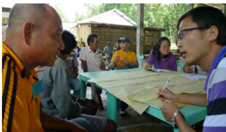
The AQD intern from China interviews a member of the local community during the practical session of the freshwater aquaculture training