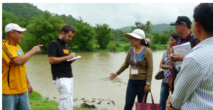
Site visit during the Training Course on Community-based Freshwater Aquaculture for Remote Rural Areas of Southeast Asia

Ten participants meanwhile attended AQD’s international training course on “Community-based Freshwater Aquaculture for Remote Rural Areas of Southeast Asia”. Funded by the Japanese Trust Fund to SEAFDEC,