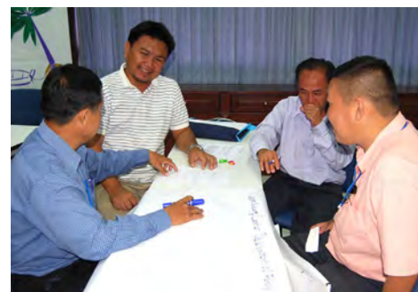
Discussion among trainees during the EAF training course