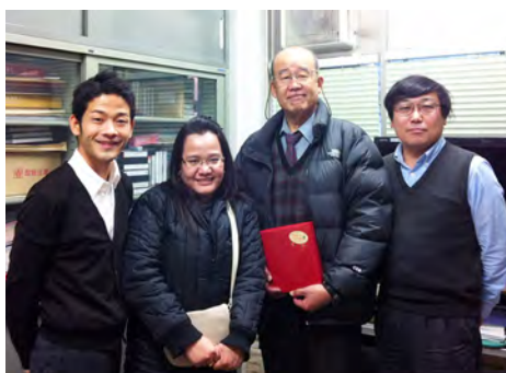
SEAFDEC Secretariat Information Officer (second from the left) during the capacity development program