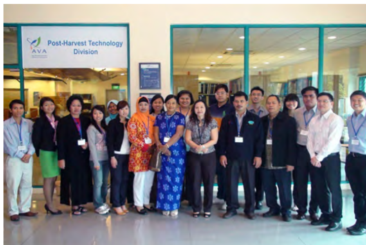
Participants of the Regional Training Course on Processing of Value-added Products from Freshwater Fish

The Regional Training Course on Processing of Value-added Products Using Freshwater Fish was conducted by MFRD in Singapore on 18-21 October 2011. Fourteen participants – two each from the project participating countries; two from the Malaysian Department of Fisheries and four from the industrial sector of Singapore attended the training. In addition one participant each from the private sector in Lao PDR, Myanmar and Indonesia also attended the course.