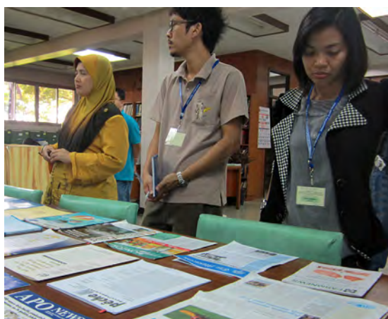
SEAFDEC information officers during the training course on capacity building on information dissemination and data management arranged by AQD