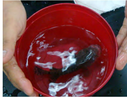
Vaccination trial for grouper

Viral nervous necrosis (VNN) is a devastating disease in cultured marine fish in Southeast Asia, and there is no cure but prevention. Although fish farmers can ensure that they do not use VNN-infected stock, the cost for screening fish broodstock, eggs and larvae by reverse transcriptase polymerase chain reaction (RT-PCR) is rather prohibitive and screening cannot protect stock from infection when fish are raised in openwater sea cages because VNN-causing virus is widespread, if not ubiquitous, in natural waters. AQD's innovative solution is the development of a vaccine.