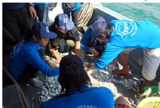
Practical session on fishing operation at sea to enhance the skills of student trainees