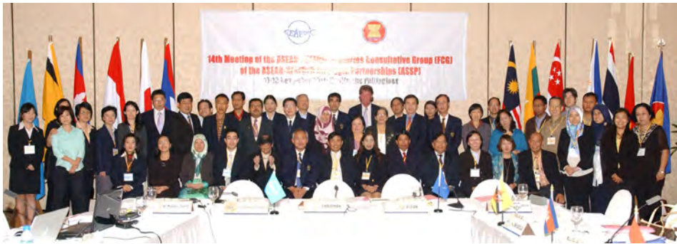
Participants of the 14 th FCG/ASSP Meeting held in Manila, Philippines

mechanism to enhance the impacts from the programs and initiatives undertaken by SEAFDEC in line with the Resolution and Plan of Action adopted by the ASEAN-SEAFDEC Ministers and Senior Officials during the 2011 ASEAN-SEAFDEC Conference.