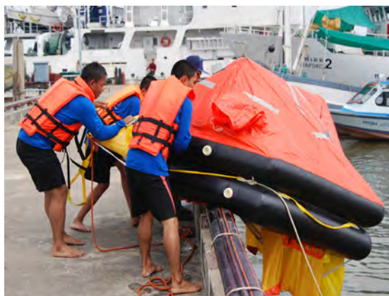
Students during the practical session to gain experience on life raft operation.