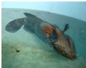
Grouper stricken by VNN