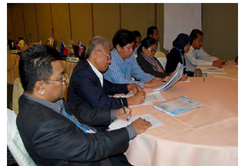
The group discussion and brainstorming session during the Core Experts Meeting

During the Meeting, the participants discussed the minimum requirements for fishing license and boat registration in the Southeast Asian region and the ways forward, as well as the information