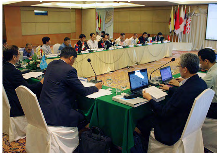
Representatives from SEAFDEC Member Countries at the Habitat Rehabilitation Workshop

Thirty-three representatives from SEAFDEC Member Countries attended in the Regional Workshop/Expert Consultation on the Identification of Critical Fishing Grounds and on Regional Habitat Rehabilitation and Management Approach organized by the SEAFDEC Training Department from 11 to 13 October 2011 in Bangkok, Thailand.