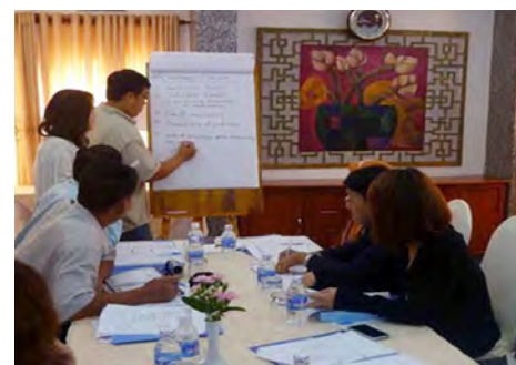
Group discussion during the Traceability Training Workshop

products as well as the issues and challenges of implementing traceability in their respective countries. ❖