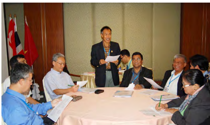
Participants sharing knowledge and experiences during the group discussion conducted as part of the Core Experts Meeting

required for the development of regional guidelines to prevent the trading of IUU fishing products. The Meeting also expressed the need for the development of dedicated e-mail network on combating IUU fishing to enhance sharing of information. As a result from the discussions, the format of minimum requirements for the regional guidelines on fishing license and boat registration was agreed among the countries. Such set of minimum requirements could serve as basis for further development of the relevant regional guidelines during the subsequent Core Expert Meeting to be organized in the future.