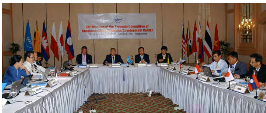
The Thirty-fourth Meeting of SEAFDEC Program Committee hosted by AQD in collaboration with the Philippine BFAR from 14 to 16 November 2011

While endorsing the programs undertaken by SEAFDEC in the year 2011, the Program Committee discussed and provided recommendations on the important areas that should be incorporated in the 2012 programs in order to address the priority needs and concerns of the Member Countries. In particular, these included the reformulation of SEAFDEC Departmental Programs to address R&D requirements of the Member Countries, as well as the regional programs under the Fisheries Consultative Group (FCG)