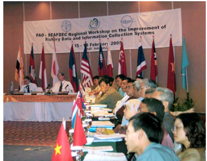
Regional Workshop on Improvement of Fishery Statistics and Information (15-18 February 2005, Indonesia)

SEAFDEC also published in 2006 the Regional Guidelines on Fishery Statistics in the ASEAN Region as part of the Supplementary Guidelines on Responsible Fisheries Management to provide regional reference or checklist for countries in the region interested in reviewing and improving their respective national fishery statistical system. Although the Regional Guidelines on Fishery Statistics in the ASEAN Region focused on improving fishery statistics for capture fisheries in the region, the Handbook on Collecting Fishery Statistics for Inland and Coastal Fisheries published by