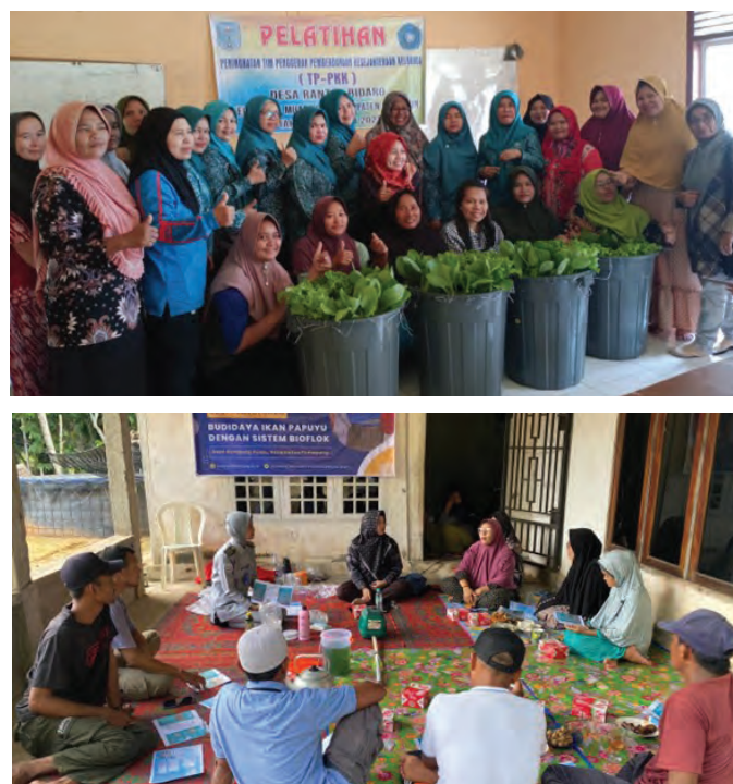
Figure 2. Participants attend capacity-building activities under the aquaculture group conducted in Merangin Regency (top) and in Batanghari, Jambi, Indonesia (bottom)

Recognizing that the ecological impacts of aquaculture depend on the fish species chosen for aquaculture, management, and location of facilities, the aquaculture group emphasized that in planning for sustainable development, serious consideration should be made on how the different fish species and production systems relate to available resources and ecosystems at the national and local levels. Figure 2 shows the various capacity-building activities conducted under the aquaculture group.