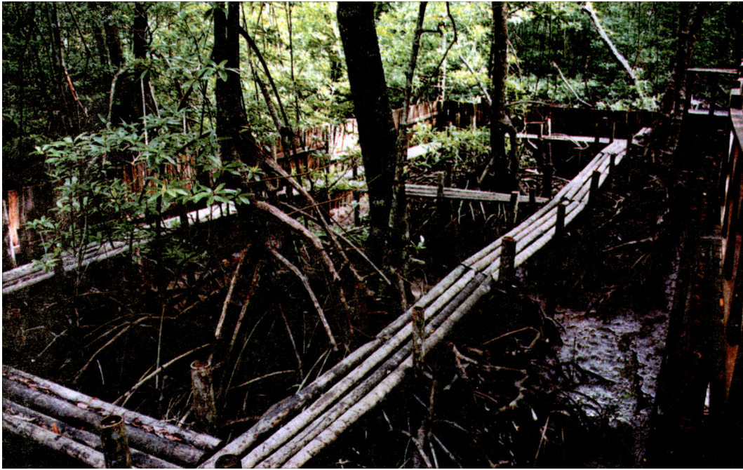
Figure 2. Crab culture farm at Kampung Serdang in Brunei-Muara

The future development of shrimp farming industry in the country will not cause significant damage to mangrove forests. In fact, lands where mangroves have grown have proved less than ideal for shrimp farming. Mangrove soils are often acidic, so that ponds excavated in these soil have to be heavily and expensively limed to maintain suitable pH. Leaving the mangrove forests intact is now recognized as yielding positive benefits. Hence, future farms will be established in areas just inland from a mangrove forest with the effluent trickling down and being filtered. Mangrove forests are superb natural filters for organic matter and what reaches the sea is more-or-less pristine water. Further, DOF will be looking for barren lands near the coasts instead of mangrove lands for the new prawn farms.