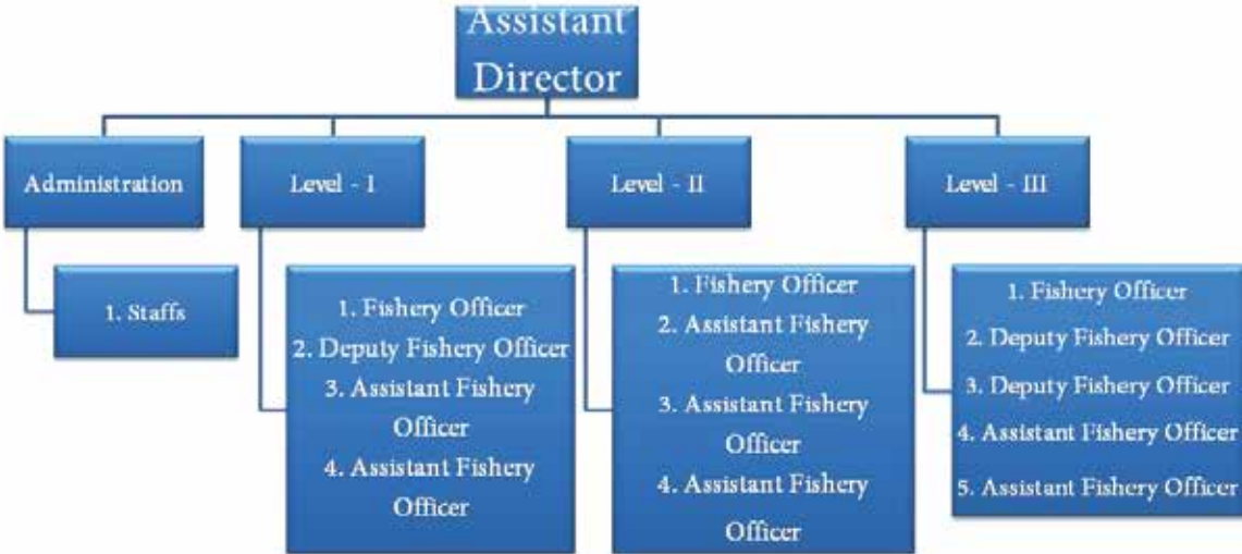
Figure 2. Organizational chart of Aquatic Animal Health and Disease Control Section of Myanmar.

The AAHDCS has been conducting surveillance using Level-1 disease diagnosis. The activities covered in the surveillance include the following; (a) report from the township fisheries officers; (b) report from the farmers directly to the aquatic animal health section; (c) occasional field visit of township fisheries officers to farm sites; and (d) recording of reports on disease occurrences. The AAHDCS has also the capability to conduct Level-II diagnosis, i.e. through histopathology and microbiology; however, upgrading of equipment and training of staff have to be undertaken. Notably, the AAHDCS laboratory has the capability to conduct Level-III diagnosis such as the use of PCR method to detect shrimp viral diseases including WSD, IHNN, TS and YHD. In addition, the AAHDCS laboratory plans to establish the diagnostic methods for