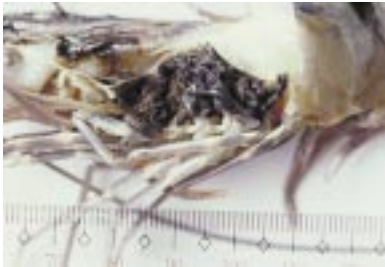
Figure 6-8. Penaeus monodon with black gill disease due to heavy siltation

Black gill disease is due to chemical contaminants, heavy siltation and ammonia or nitrite in rearing water; high organic load due to residual feed, debris, and fecal matter on pond bottom (i.e. black soil).