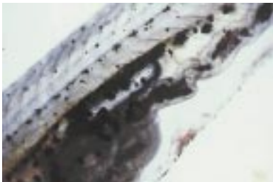
Figure 6-1. Gas bubble in the gut of milkfish fry