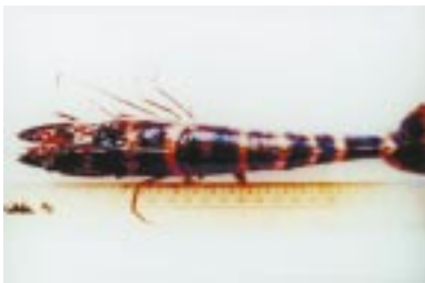
Figure 6-9. Penaeus monodon with early signs of red disease

Red disease in shrimps is associated with high application of lime (2-6 tons/ha) in the pond that gives it a high initial pH; prolonged exposure to low salinity (6-15 ppt).