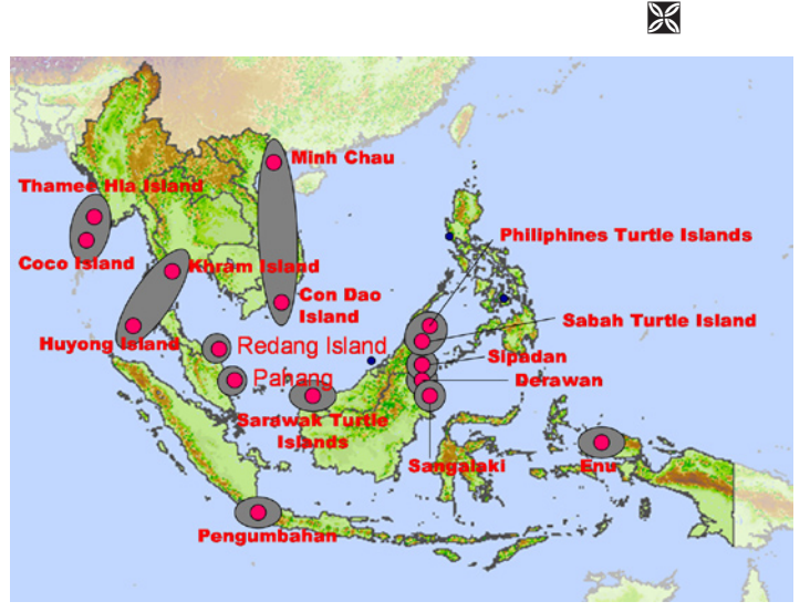
Location of 12 genetically distinct breeding stocks or management units of green turtles (Exact test of sample differentiation based on haplotype frequencies Raymond M. and F. Rousset. 1995).

Study on Detection of Multiple Paternities of Male Green Turtles was also conducted by MFRDMD at Mak Kepit Beach, Terengganu. The objectives are to determine the level of multiple paternity and to estimate adult male stock sizes at nesting beaches in Redang Island, Terengganu. A total of 300 tissue samples of hatchlings green turtle from 10 nesters in Mak Kepit beach, Redang Island of Terengganu, Malaysia had been analyzed through DNA microsatellite marker. The DNA microsatellite marker can be used to determine whether all the hatchlings in a nest have the same father or different fathers. Single father will present one to two paternal alleles, while clutches with three to four paternal alleles represented offspring from a mating between one female and two male turtles. If more than four paternal alleles were present, the clutch was assumed to have a minimum of three fathers.