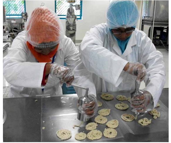
Hands-on practical session to make the value-added product, fish murukku

Fourteen participants – two each from the participating countries; two participants from the Malaysian Department of Fisheries and four industry participants from Singapore attended the training. Lao PDR, Myanmar and Indonesia had sent one participant each to represent the private sector (commercial co-operant).