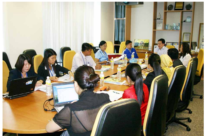
Project Planning and Inception Meeting held at MFRD/Singapore

The Meeting agreed that the new products to be developed in this project should be targeted at Small and Medium Enterprises and therefore should utilize simple and easy-to-use equipment and technology. The Meeting identified the types of freshwater fishes to be utilized and the products to be developed in each country. The Meeting also deliberated on the product development and processing trials to be conducted in the participating countries as well as the publication of the processing handbook on the products developed.