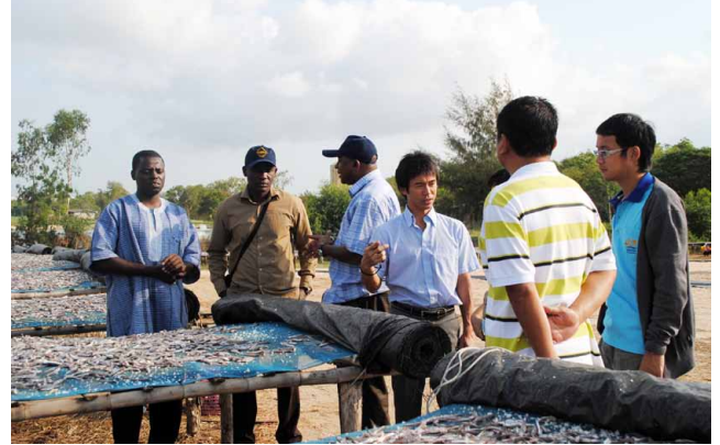
Senegalese officers observed on-site activities on fisheries management

co-management, rights-based fisheries, community involvement and application of ecosystem approach to fisheries management, as well as fishery extension methodologies. ❖