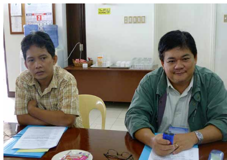
Community stakeholders from Sagay City where AQD has a community-managed stock enhancement project, also attended the progress meeting

In particular, two community stakeholders expressed their appreciation of AQD’s project at Sagay Marine Reserve in northern Negros, west central Philippines, stating that: “the technical advances introduced, like sandfish nursery and grow-out, serve as good alternative livelihood to fishing especially because the reserve has enforced a no-take policy”. ❏