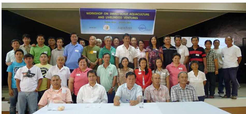
Participants in the milkfish-seaweeds aquaculture training course