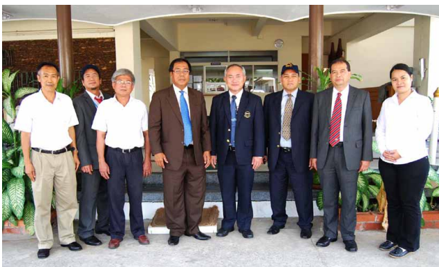
With TD officers are Malaysian officials during their visit to TD