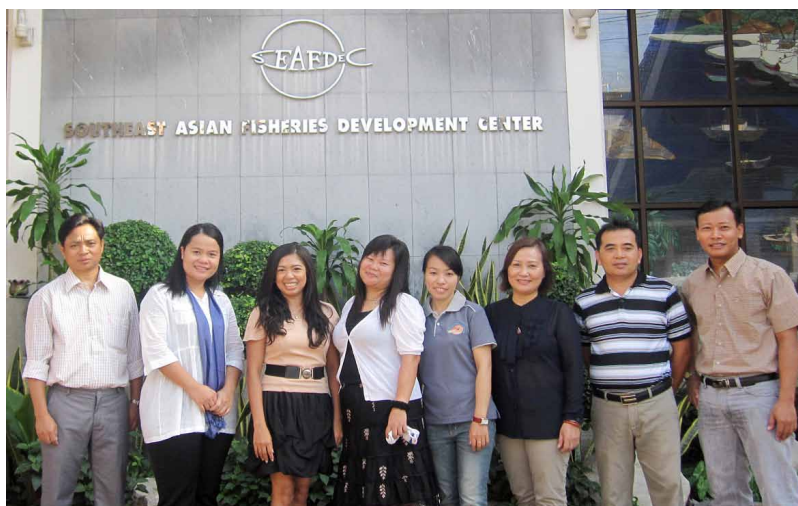
Eight RFPN members representing their respective countries at SEAFDEC

RFPN members play an important role in bridging the networking mechanism between SEAFDEC and the Member Countries, and are involved in providing inputs that could help in addressing regional fisheries-related issues. They