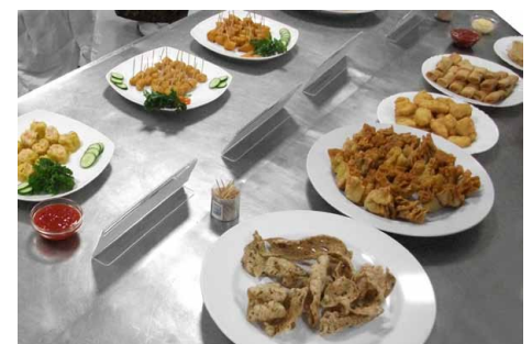
Value-added products made by participants on the last day of the training