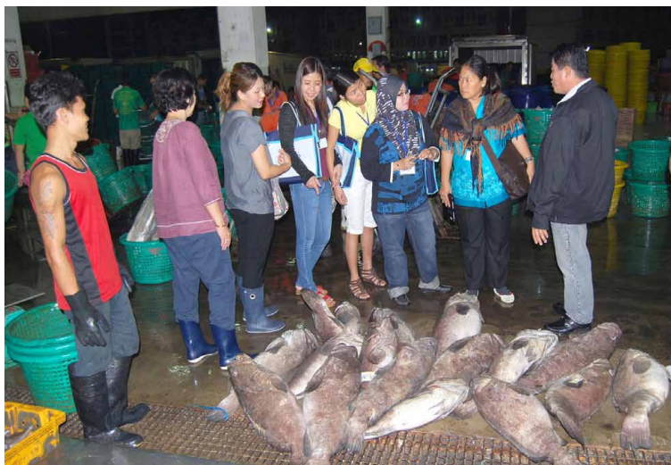
MCS training course participants visited a fish market and observed various aspects of MCS

The training course was delivered through class lectures, field visits to observe various aspects of MCS, and a 2-day practical workshop on the Application of the MCS in Combating IUU Fishing in Southeast Asia. ✪