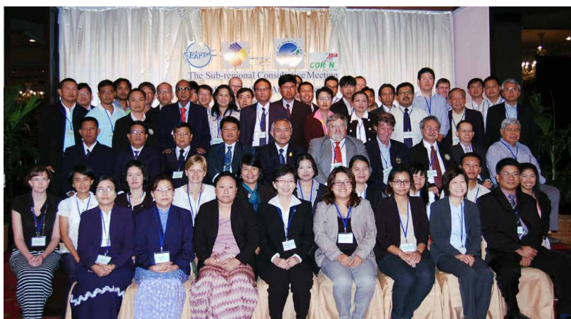
Participants in the Sub-regional Consultative Workshop of the Northern Andaman Sea, 13-14 March 2012