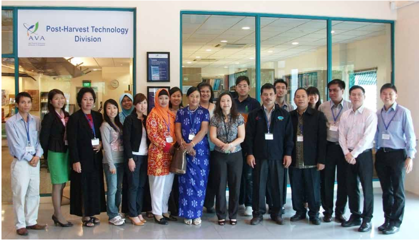
Participants and trainers of the regional processing training course (above); and sensory evaluation of the products (right)