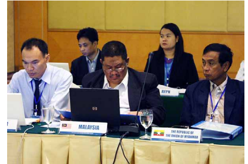
Participants of the 2012 Fisheries Co-management Workshop

compiled by SEAFDEC for publication into a form of a guidebook, intended for fisheries officials and national fisheries organizations. ✦