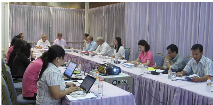
The 2011 Annual Review Meeting for the SEAFDEC-Sida Project

While highlighting on the efforts made continuously on the promotion of sub-regional cooperation around the Andaman Sea, the Meeting also noted the information on important areas such as fisheries and habitat management, as