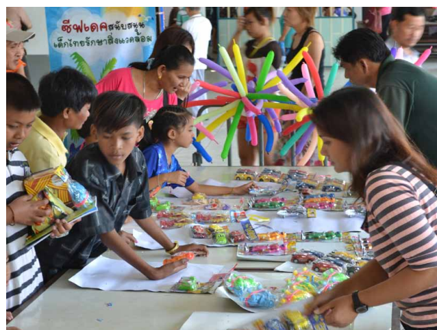
Children participated in activities at the TD booth

government organizations, especially the Prime Minister, and military which staged impressive shows for the benefit of the children, as their contribution to the future generations of the nation. ❖