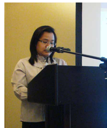
Representative from SEAFDEC presenting a paper during the Workshop

Meanwhile, the Workshop recognized the need to strengthen the collection of fisheries data in the BOBLME countries which could proceed by developing