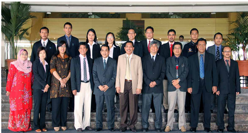
Participants in the 3 rd Sub-regional Meeting on RPOA and IUU Fishing in the Southern and Eastern Areas of the South China Sea and the Sulu-Sulawesi Seas

in Kota Kinabalu, Sabah, Malaysia. The Meeting was also attended by delegates from Indonesia, Malaysia, Philippines, representatives from the RPOA Secretariat, WorldFish Centre, Coral Triangle Initiatives on Coral Reefs, Fisheries and Food Security (CTI-CFF), and Malaysia Maritime Enforcement Agency (MMEA).