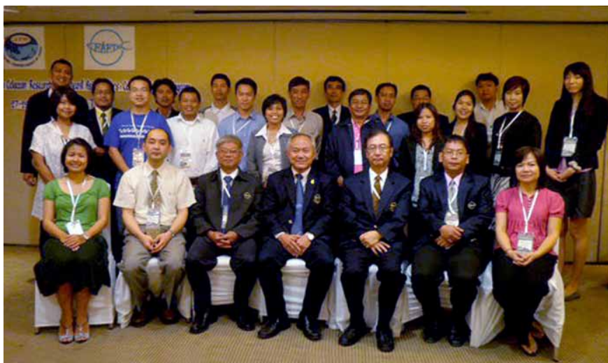
Participants of the cetacean research project meeting