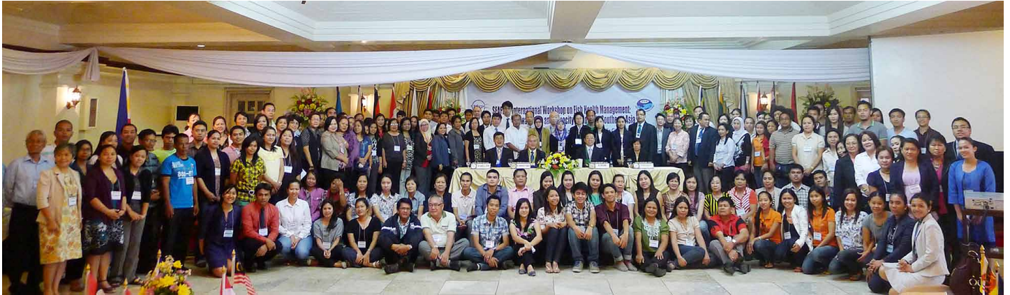
Participants in the International Workshop on Fish Health Management organized by AQD

security, and aquaculture sustainability. It also emphasized on the need for enhanced regulations and better monitoring of diseases in accordance with the protocols of the OIE (Office International des Epizooties). Real-time disease reporting is also necessary so that countries can have access to information on diseases of regional concern. ☒