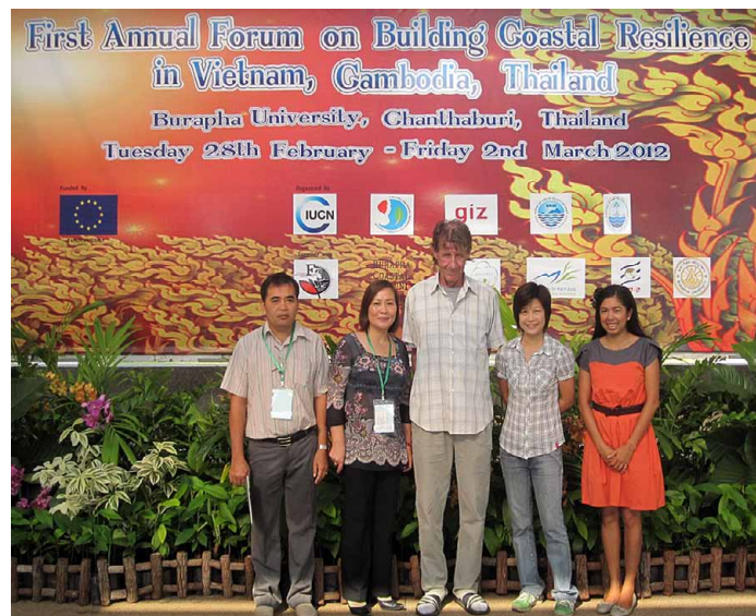
SEAFDEC staff and RFPN members attended at the 1 st Annual Forum on Building Coastal Resilience

During the field trip, initiatives and efforts of local communities in conserving and rehabilitating their mangroves and management of their fisheries to strengthen their capacity for climate change adaptation and disaster risk reduction in the future were also demonstrated. ☒