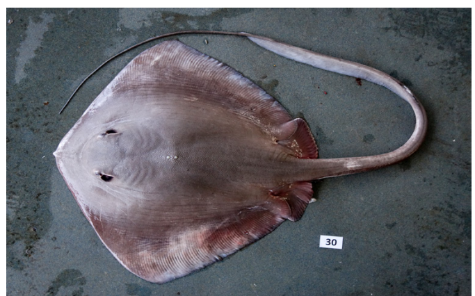
(Top) Shark specimens collected (Sphyrna lewini); and (Below) Ray specimens collected (Pastinachus gracilicaudus)