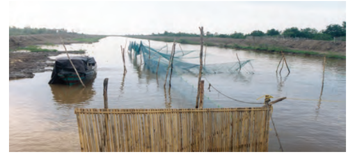
Fig. 5. Selambau (filtering net)