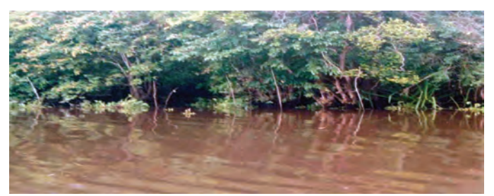
Flood plain in swampy forest