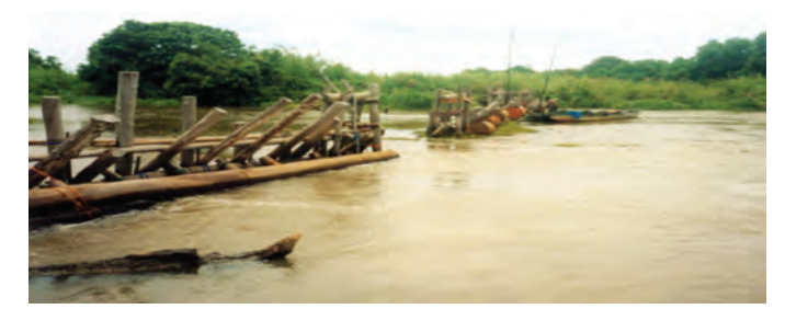
Fig. 2. Tuguk (filtering device)

device, active seine. The peak fishing season of hampang , selambau (filtering net), tuguk ( Fig. 2 ), and bubu (pot trap), is at the end of the wet months (April-May) and the begining of wet months (October-November), catching the fishes that move from the flooded areas to rivers and from rivers to flooded areas, respectively. For the active barrier ngesar or ngesek ( Fig. 3 ) and beje (pond trap), their peak fishing seasons is during the dry months (July-September) when the depth of swampy areas and river is shallow allowing the fish to be caught by these gear. Meanwhile, jaring (gill net), pancing (hook and line), and jala (cast net) could catch fish throughout the whole year.