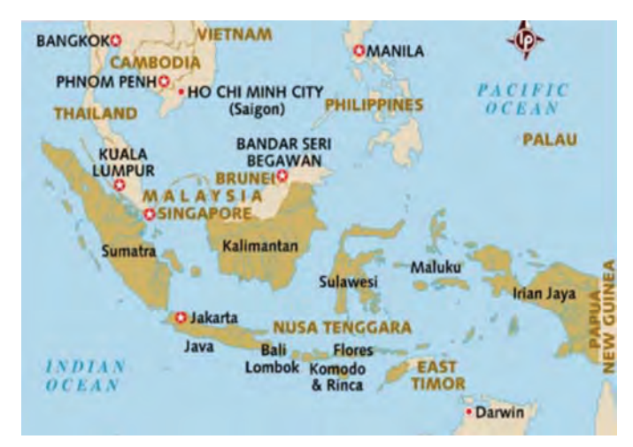
Map of Indonesia showing Sumatra (traditionally known as Sumatera)

Flood plain areas are among the major open waters with high productivity. In South Sumatera for example, these areas supply the local communities' requirements for nutritious food from fish with an average food demand of 23 kg/capita/