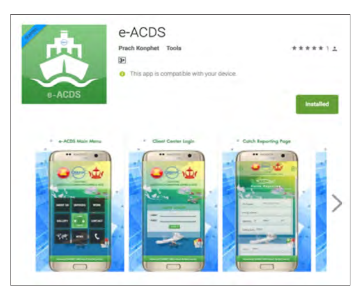
Fig. 3b. eACDS Mobile Application via URL