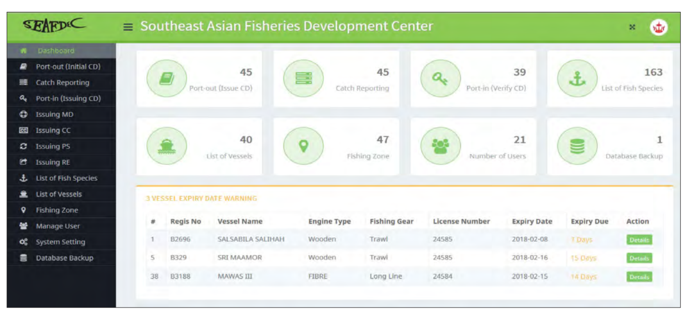
Fig. 2. Web-based Application of the eACDS

in the system, list of vessels, fishing zones, number of users, and database backup; (2) Port-out Menu; (3) Catch Reporting Menu; (4) Port-in Menu; (5) Issue MD Menu; (6) Issue CC Menu; (7) Issue RC Menu); and (8) Issue PS Menu.