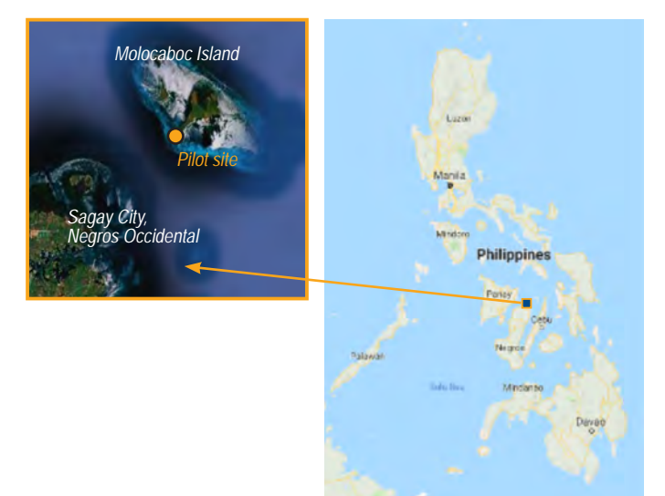
Fig. 1. The pilot site in Molocaboc Island, which is part of Sagay City, Negros Occidental, Philippines

Seahorses are vulnerable species due to habitat degradation and pressure arising from illegal, unreported and unregulated collection of these resources for traditional Chinese medicine and to a lower extent, the marine aquarium and curio trade (Vincent et al. , 2011; Foster et al. , 2016). Recognizing that the release of captive-bred animals to augment the threatened wild populations needs to be managed carefully to circumvent damages to the wild seahorse populations as results of disease introductions and genetic contamination of the natural