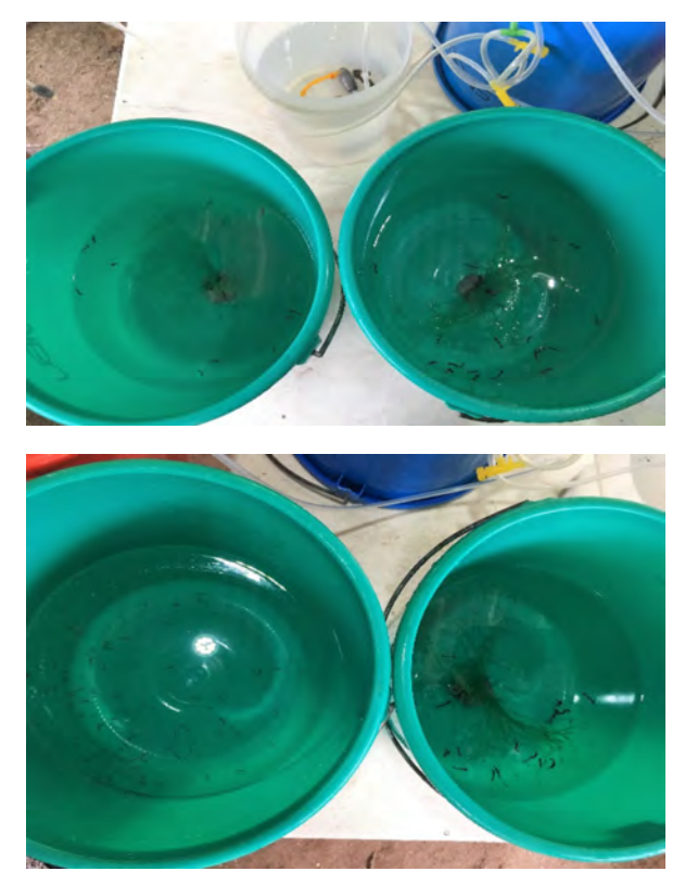
Fig. 6. Juvenile seahorses reared in 10L plastic pail

A community-based hatchery facility in Molocaboc Island was constructed to establish a technique for seahorse hatchery using the available natural food for seahorses in the area. Pregnant male seahorse breeders were collected from the patch coral reef and transferred to 10-L plastic pails at stocking density of 1 ind/5 L (Fig. 6). Mild aeration was provided using solar-powered aerators. Pail bottom was siphoned daily at 30-50% water change.