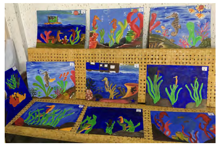
Fig. 8. Finished art works of the students joining the "Draw and Tell Contest"