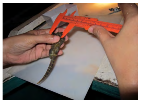
Fig. 5. Measuring of seahorse to determine size-at-release

Using such information for transporting the seahorses, there was 100% survival of the seahorses upon arrival in Molocaboc Island, for all size groups at all stocking densities for the 10 and 12-h transport duration. However, after 7 days of observation, only those with stocking densities of 1, 2 and 3 ind/L for all three size groups showed 100% survival. As a result, the survival for all size groups ranged at 70-85% and 50-60% for the transport stocking densities of 4 and 5 ind/L, respectively. The result also suggested that the optimum stocking density for transport should be 3 ind/L for 5-7 cm SH seahorse juveniles for a 12-h transport duration.