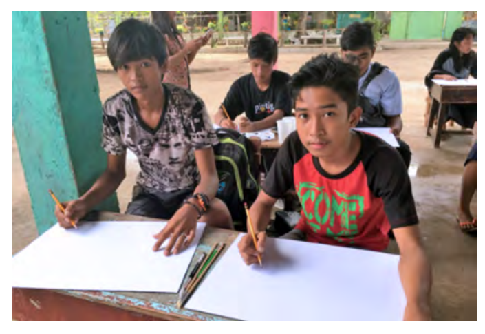
Fig. 7. Two of the students of Molocaboc Island creating their entries to the "Draw and Tell Contest" which aimed to promote seahorse as a natural resource in the community

contest. Their art works which showed seahorse in corals and sea grasses, also exhibited the importance of protecting the natural habitat of seahorses to safeguard the dwindling population of seahorses in the wild ( Fig. 8 ).