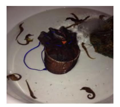
Fig. 4. PVC pipes used as temporary holding for seahorses

For the density monitoring of seahorse population, the local divers had to undergo training on the proper handling of live seahorses, conducted by AQD researchers. More particularly, practical lectures were given to the divers for them to learn the skills and techniques of handling live seahorses during sampling to minimize stress on the animals, including the proper use of PVC pipes that temporarily hold the seahorse samples ( Fig. 4 ).