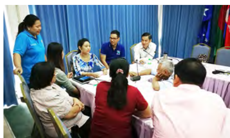
Group discussion during the “Training Workshop on Gender Analysis in Fisheries Sector”

In the subsequent Training Workshop, the understanding of relevant stakeholders on gender analysis was enhanced using the tools and methods for integrating gender concerns within the fisheries research. This was achieved through the discussions on key gender issues related to fisheries and the rationale for using the gender lens. During the Workshop’s group exercises and breakout meetings, the participants examined the gender analysis survey tools that were used for collecting the relevant data during the field study, and rationally analyzed and interpreted the data collected during the said field study. Additionally, the capacity and vulnerability assessment tool was also introduced; while its application in research works related to fisheries, gender, and climate change was discussed. The participants also enhanced their skills in designing gender integrated planning framework, developing monitoring and evaluation mechanisms using gender sensitive indicators, and assessing external and internal risks while planning. These aspects are necessary for integrating gender issues and carrying out gender analysis in the research and development cycle. ✂