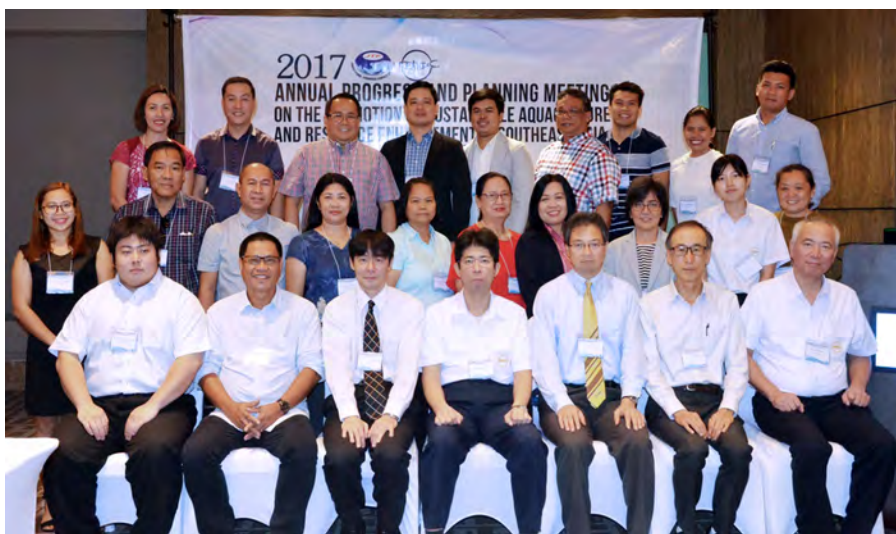
Participants of the 2017 Annual Progress and Planning Meeting