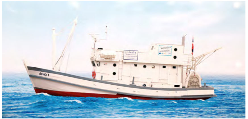
The M.V. PLALUNG 1 prior to (left) and after the renovation (right)

superstructure to facilitate retrieving of trawl net with minimal number of fishing crew. A sewage tank was also installed in the engine room to treat all wastes onboard prior to disposal.