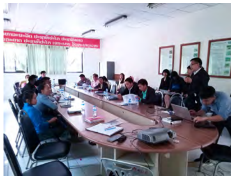
During the discussion and sharing experiences on CBRM/co-management project with researchers

The SEAFDEC Training Department conducted the monitoring and facilitation of the CBRM/Co-management at the pilot site in Nam Xouang Reservoir, Lao PDR from 29 January to 3 February 2018. The activities included: 1) training for local government officers to increase their knowledge on fisheries management; 2) workshop for the unification of fisheries rules and regulations in Phone Hong and Naxaythong Districts that will be applicable to Nam Xouang Reservoir; 3) discussion and sharing of experiences on CBRM/Co-management project with the researchers from SEAFDEC/IFRDMD; and 4) introduction of the project to intern students from the University of Tokyo, Japan.