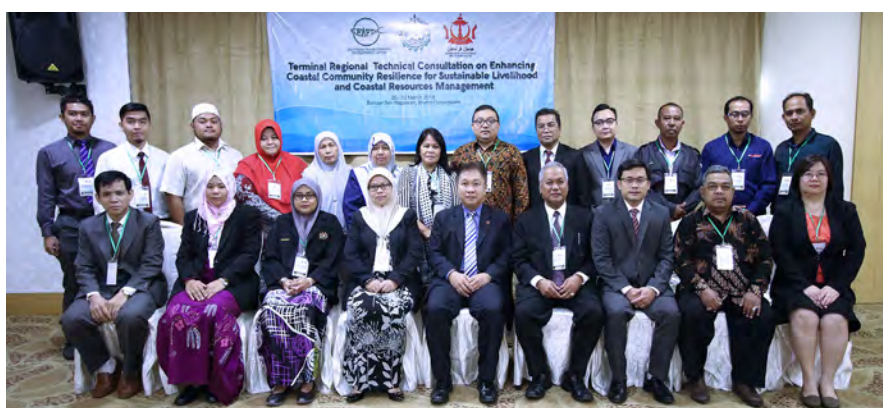
Participants in Terminal RTC on Enhancing Coastal Community Resilience for Sustainable Livelihood and Coastal Resources Management