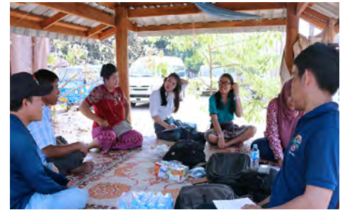
MRC and IFRDMD staff during the discussion and interview

In Ban Ang Gnai, Lao PDR, river fisheries are undertaken mostly by local communities, each fishing in their area. The Mekong River and its main tributaries are essential when it comes to fish migration. The IFRDMD researchers, in collaboration with officers from the Department of Livestock and Fisheries of Lao PDR, explored the ways of developing suitable habitat conservation/resources enhancement measures. Information were collected from the country's Fisheries Division regarding the current issues related to inland fisheries in Lao PDR including