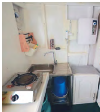
Renovation of the sleeping quarter, mess room, toilet, and galley in compliance with C188