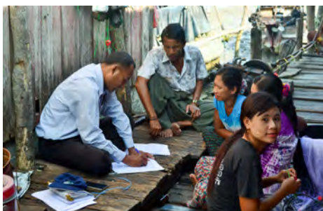
During the survey and interview

On the next day, the team visited Yangon Region Fisheries Office to discuss the current effort of Myanmar in establishing a One Stop Service (OSS) for the registration and control of port in-port out movement of fishing vessels. OSS was established through the coordination among relevant governmental agencies in Myanmar that deal with fisheries, immigration, customs, and marine affairs. ✂