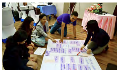
Group discussion during the “Workshop on Gender Analysis in Fisheries Management in Coastal Communities in Cambodia, Myanmar, and Thailand”

The SEAFDEC-Sweden Project has collaborated with IUCN through the Mangrove for the Future (MFF) and SEI to jointly undertake a regional field study on gender in fisheries (2017-2018) which aims to explore gender patterns in coastal and marine resources management and improve the understanding of the state of women and men in environmental decision making, and the structural challenges preventing equitable opportunities for men and women in relation to the coastal and