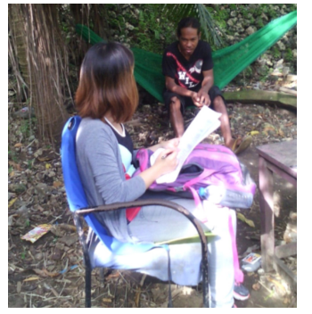
Fig. 4. Focus group discussions and household surveys with the community in Pandaraonan, Nueva Valencia in Guimaras, Philippines