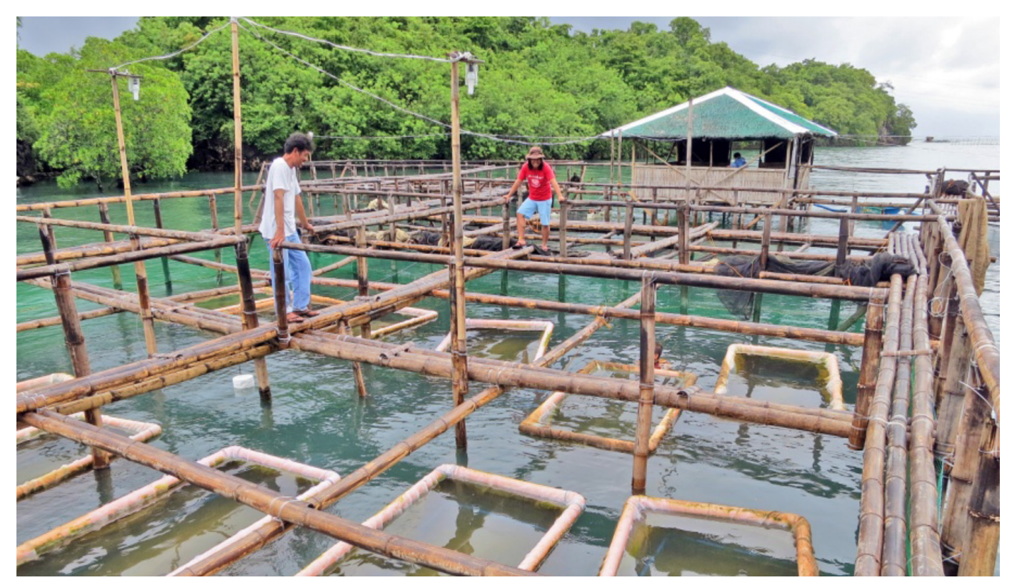
Fig 3. Sea cucumber nurseries at the Igang Marine Station of SEAFDEC/AQD at Nueva Valencia, Guimaras, Philippines

Sandfish juveniles for sea ranching were produced at the SEAFDEC/AQD sea cucumber hatchery ( Fig. 2 ) using only locally sourced wild sandfish breeders from Pandaraonan and adjacent coasts for spawning. Hatchery rearing lasted up to 45 days, after which the juveniles at early stage of development were transferred to sea-based floating nurseries at the Igang Marine Station (IMS) of SEAFDEC/AQD ( Fig. 3 ) before they were stocked at the adjacent sea ranch site in Padaraonan.