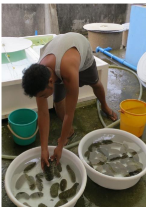
Fig 2. The sea cucumber hatchery at SEAFDEC Aquaculture Department in Tigbauan, Iloilo, Philippines