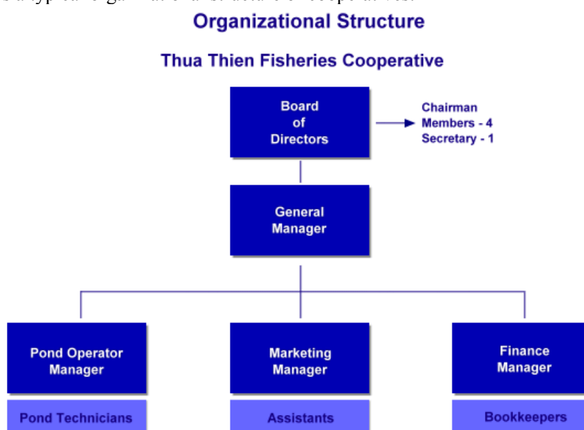
Figure 3. Organizational structure of a cooperative

Below is a typical organizational structure of cooperatives: