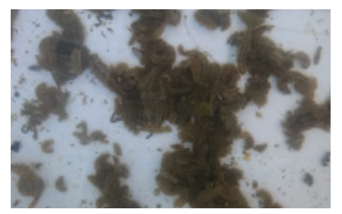
Figure 4. Sea cucumber juveniles for mariculture trials at Masinloc Bay, Zambales

While stocking was done at the near end of the dry season in April, the incoming wet season from June to November, has laid a good culture environment for the sea cucumber as indicated by its increasing growth trend. Although in some