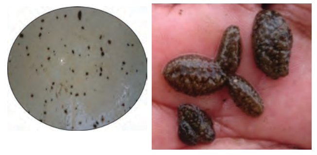
Figure 3. Sea cucumber seeds produced at the DA-BFAR ROSMW for mariculture trials in Masinloc Bay, Zambales

At the outset, the DA-BFAR TOSMW refined the breeding and culture techniques developed by the University of the Philippines-Marine Science Institute (UP-MSI) for H. scabra using broodstocks from the wild, to suit the environmental conditions of Masinloc, Zambales. The DA-BFAR TOSMW also adapted the breeding and hatchery technologies developed by SEAFDEC Aquaculture Department (SEAFDEC, 2015) for the sea cucumber, resulting in continuous supply of seeds ( Figure 3 ) for the mariculture trials and stock enhancement activities in Masinloc Bay, Zambales.