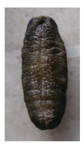
Figure 6. Adult sea cucumber for processing and marketing

Table 3. Monthly sampling results of sea cucumber cultured in marine pen in Masinloc Bay, Zambales