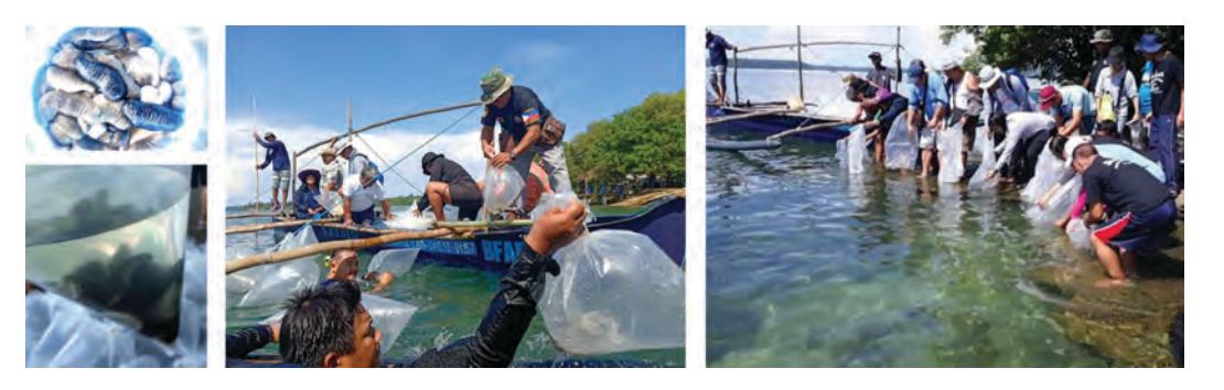
Figure 8. Sea cucumber being prepared by the DA-BFAR ROSMW for resource re-establishment activities ( left ), and resource enhancement ( middle ) and sea ranching ( right ) in Masinloc, Zambales

wild as their source of livelihood. Nevertheless, beyond four months of culture, juveniles could be spilling over in adjacent areas and thus, facilitating stock enhancement which is also in line with the efforts of the Philippine Government to revive the natural stocks of sea cucumber in the country which is feared to be almost at the verge of collapse.