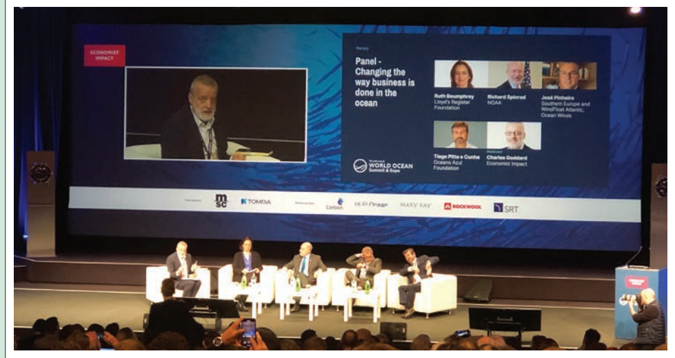
One of the panels at the 10th Ocean Summit, titled "Changing the Way Business Operates in the Ocean"