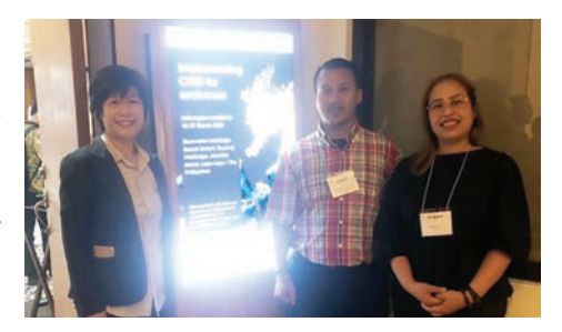
SEAFDEC representatives who attended the Workshop and SEAFDEC.

Staff from the SEAFDEC Secretariat, Training Department (TD), and Marine Fishery Resources Development and Management Department (MFRDMD) participated in the "Regional Workshop on Implementation of the CITES for Seahorses in Asia" organized in Cebu, Philippines from 14 to 17 March 2023. The Workshop was co-organized by Project Seahorse, IUCN SSC Seahorse, Pipefish and Seadragon Specialist as representatives from FAO, TRAFFIC, Group, and Zoological Society of London-Philippines in collaboration with the Philippine Bureau of Fisheries and Aquatic Resources and National Fisheries Research and Development Institute. The attendees of the Workshop include representatives from relevant government agencies (fisheries, forestry, coastal and marine resources, marine parks, environment) in Asia, experts from universities and local NGOs as well respective countries were analyzed