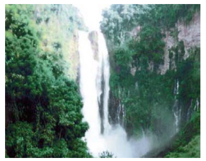
The majestic Maria Cristina Falls (Lanao del Norte, Philippines), outlet of Lake Lanao towards Iligan Bay

The attachment of the Maranaos to Lake Lanao is insurmountable. American writer Washburn (1978) described the relationship between the Maranaos and their watering place, the Lake Lanao as: "To the Lake, the Maranaos have bound their identity. In their own eyes and in the eyes of the outsiders, they are Maranaos known as the Peoples of the Lake. On its shores, they established their villages and towns and built their mosques. With its water, they purify themselves for prayer. In its wetlands, they cultivate their rice. From its depths, they gather fish. Across its spans, they transport goods and people. From it they take water for drinking and cleaning. Each boulder and island in the Lake, each hill and valley in the land surrounding it is woven into the legend and epics of the people. Each Maranao can willingly trace his ancestry to the original "pat-a-pangampong," the four encampments on the lake, their mythical founders, also known as the four winds, in the Maranao mythology that prevented the inundation of the Lake by cutting an outlet. Thus, it is with some justification and no little pride that the Maranaos consider the Lake Lanao as Our Lake."