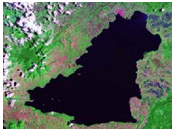
Satellite picture of Lake Lanao in Lanao del Sur, Philippines

Lake Lanao is located near Marawi City the capital of Lanao del Sur Province in Mindanao Island, Philippines. It is the largest lake in Mindanao and the second largest lake in the Philippines after Laguna de Bay near Metro Manila (BFAR, 2005).