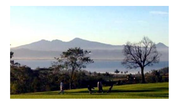
View of Lake Lanao (in Marawi City) from the rolling hills of MSU with the "Sleeping Beauty Mountain" in the background

The worsening socio-economic conditions of the lake communities still prevail despite hosting the Agus power