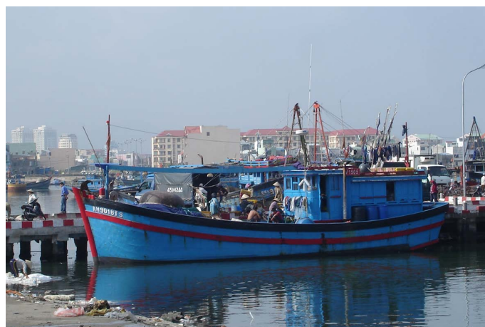
Fishing port in Da Nang, Vietnam

Following Färe et al. (1985, 1994), the determinants of the technical efficiency could be determined by applying various methods, which could be either non-parametric such as the Data Envelopment Analysis (DEA) or parametric such as the Stochastic Production Frontier (SPF) analysis. Since the DEA introduced by Charnes et al. (1978) is based on mathematical program approach it does not impose any assumptions about functional forms and does not take into account random error, and thus could be biased under the production process that largely involved stochastic elements. In contrast, the SPF approach imposes explicit functional form and distribution assumption on the data and thus, could account for the random errors including those induced by weather and luck (Aigner et al. , 1976; Aigner et al. , 1977; Meeusen and van den Broeck, 1977). The SPF analysis could therefore be appropriate for examining the relative technical efficiency of any “firm” or “entity” that exploits renewable resources due to the involvement of stochastic characteristics in the production process (Kirkley et al. , 1995; Sharma and Leung, 1999).