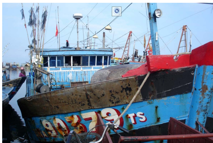
Gillnet fishing vessel in Da Nang, Vietnam

In 2009, 98 gillnetters (82.4%) from Da Nang aiming for high fishing efficiency, were organized into gillnet groups with about 22 vessels in each group. The fish catch landed by the gillnet groups during that same year was over 9 million metric tons accounting for around 85.0% of the total fish production of the Province. Each gillnet fishing group comprising about 3-5 vessels were operated collaboratively based on family loyalty, which is known to have brought more benefits to the group members, while the members support each other in terms of sharing information on fishing grounds, providing mechanical support in case of an engine failure, and sharing supplies such as fuel, water and food, among others.