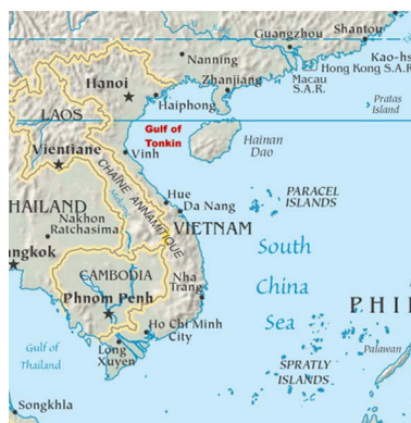
Above: Catch landed by gillnetters in Da Nang Left: Gulf of Tonkin as the main fishing grounds of gillnetters.

A typical gillnet vessel in Da Nang has a hull length longer than 19 m (for large vessels) and capable of making trips longer than two weeks including travel time. The vessel is usually equipped with 300-350 gillnet sheets per boat (50 m long per sheet) and manned by a captain and crew of 10-11 members. The gillnet vessels in the medium category (17-19 m) normally carry 200-280 sheets, manned by a captain and crew of 8-9 members and making trips that last for 7-10 days. The gillnet vessel in the small category (<17 m) have 150-200 sheets, a captain and crew of 6-7 members and make trips for 4-7 days. Sharing of the benefits from this fishery is based on the monthly net income, which is the difference between the gross revenue and total variable costs except labor costs. The net income is divided into 10.5 parts, where the vessel's owner takes 3.5 parts, 3.0 parts for the fishing gears (shared between the owner and crew members who contributed the gillnet sheets), and the remaining 4.0 parts shared among the laborers.