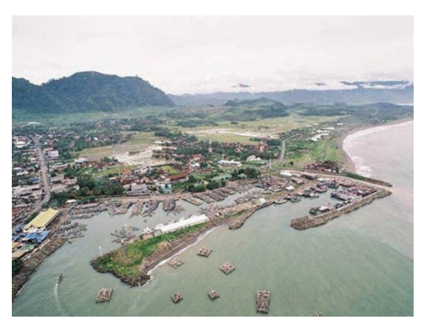
Archipelagic fishing port of Pelabuhan Ratu, Sukabumi, West Java

Another means of enhancing MCS in Indonesia is through the community-based fisheries surveillance system, where community groups undertake the observation at sea and land, and to report to proper authorities in their communities the suspected fishers and vessels conducting illegal fishing. It was reported that 1,419 community groups have been involved in fisheries surveillance in 2009 and the number tends to increase year by year. The involvement of community groups is MCS is an integral part of a nation's sovereignty.