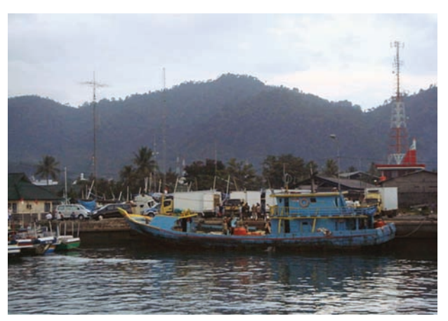
Registered fishing vessels in Pelabuhan Ratu, Sukabumi, Indonesia

fishing weakens fishery resources management because of overfishing, as a result, it has been estimated that Indonesia loses revenues of more than US$ 4.0 billion annually due to IUU fishing. This estimate does not include the social and environmental costs of the losses of future access to the country's fisheries resources.