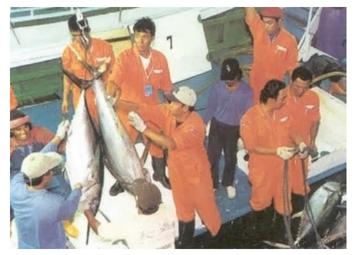
Catch inspection on board

well with the requirements of the European Council (EC) Regulation No. 1005/2008 in Combating Illegal, Unreported and Unregulated (IUU) Fishing. Following the EC Regulation, other countries are also taking measures to combat IUU fishing and that many importing countries also require that a system of traceability on fish and fishery products should also be put in place. This augurs well with