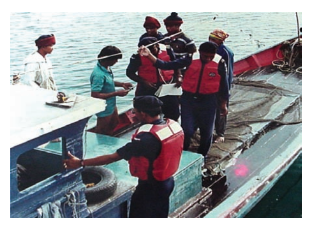
Regular monitoring of fishing activities being done by the Department of Fisheries Malaysia

The aforementioned initiatives should therefore be effectively implemented in order to realize the successful advancement of the NPOA - Fishing Capacity and achieve its target, considering that the government is also faced with a daunting task of overcoming certain weaknesses. The inadequacy to carry out the MCS efficiently has somewhat been a bane in carrying out the NPOA - Fishing Capacity effectively. Since enforcement by the Department of Fisheries Malaysia alone is insufficient, the cooperation of other maritime enforcement agencies is necessary in which case close cooperation should be promoted among the maritime enforcement agencies. Moreover, in order to achieve good governance of the resources, all stakeholders should also play an important role in the implementation of the NPOA – Fishing Capacity.