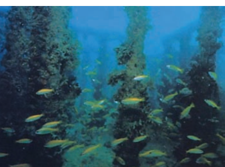
Above: Trawlers from Zone B under the Exit Plan Programme converted into artificial reefs. Below: Artificial reefs for conservation and enhancement of resources