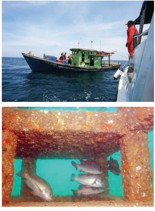
Above: MCS conducted by Malaysian patrol boat; Below: Artificial reefs in Malaysian waters.

The current inadequate involvement of the stakeholders should be improved and strengthened especially in controlling IUU fishing. Furthermore, it is also necessary to improve the legislative aspects including the formulation of specific laws that aim to address overfishing as well as in the use of the VMS as a tool for management. Although Malaysia has put in place some forms of Monitoring, Control and Surveillance (MCS) management system, the country still seems inadequate in addressing surveillance, because such effort would entail a huge budget which in the past few years had been insufficient making it difficult to control over the fishers. Another approach which is now being pursued with respect to monitoring the fishing capacity is enhancing the participation of local communities in the MCS, giving them a basis for striking a balanced level of authority and responsibility during the management of the resources which they are exploiting, and also solving the local conflicts among the fishers.